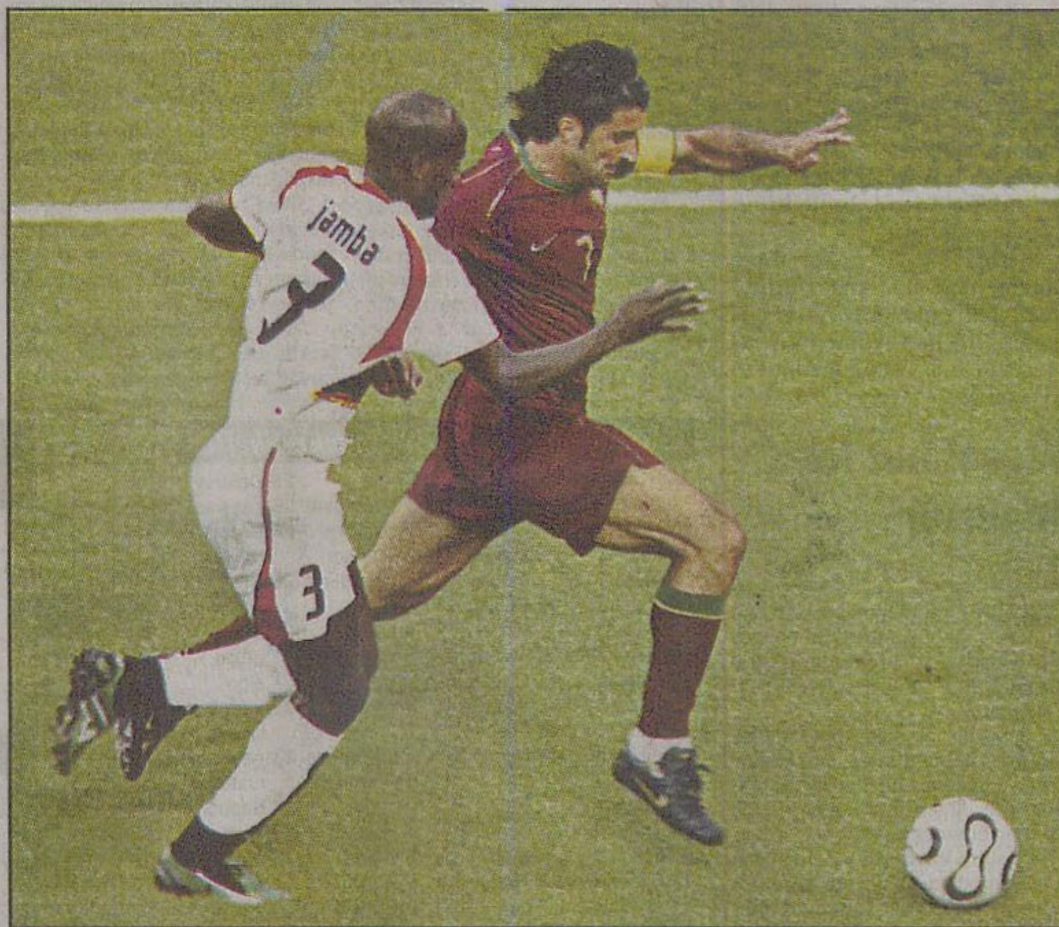
THE FINAL PASS: Luis Figo (R) releases the ball past Angolan defender Jamba to set up Pauleta (not in picture) score the match winner in their World Cup Group D match in Cologne on Sunday.