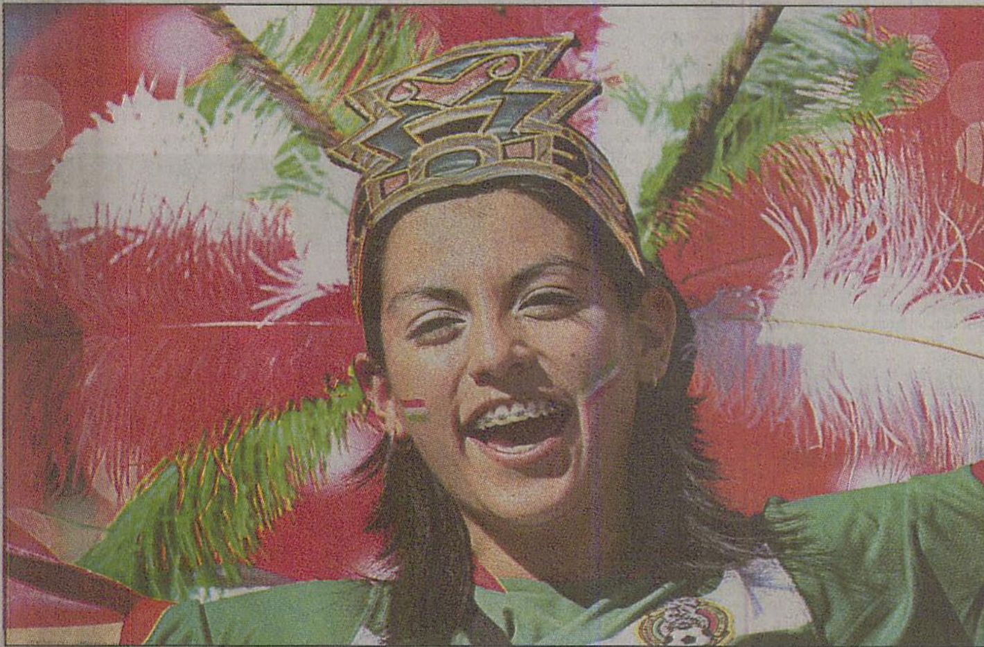
IN HER BEST BIB AND TUCKER: An all-smiling Mexican girl cheers her national team ahead of their match against Iran at Nuremberg's Franken Stadium on Sunday. Mexico won 3-1.