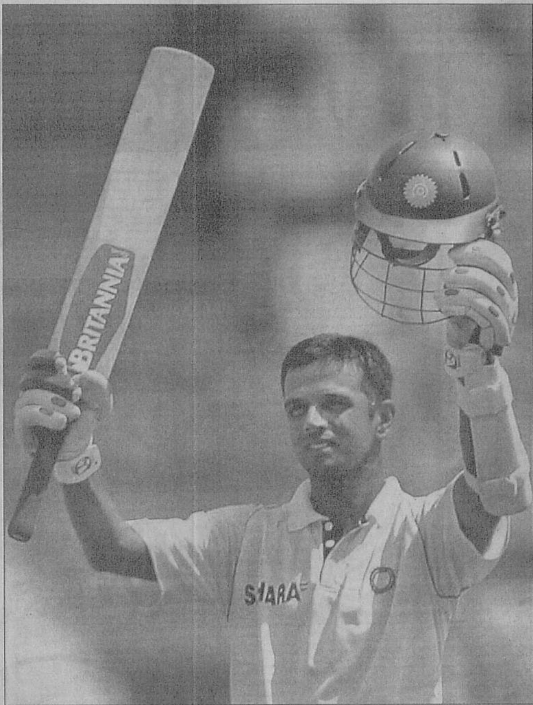
India captain Rahul Dravid salutes the crowd after scoring his 23rd Test century on the second day of the second Test against West Indies at the Beausejour stadium in Gros Islet on Sunday.

and hit a few firm strokes before he was caught at cover off Chris Gayle to leave India on 555 for seven.