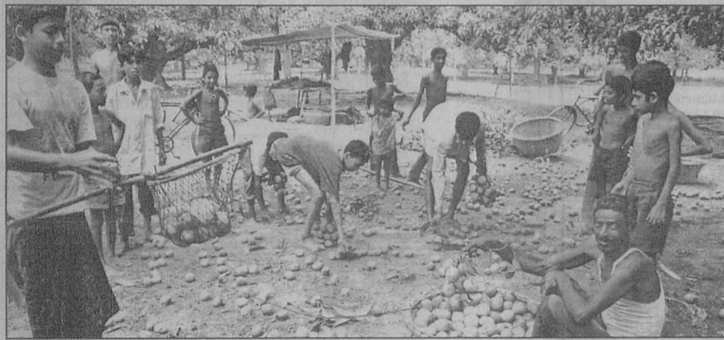
A bumper yield of mango in off-year has brought smiles on faces of all in Kansat in Chapainawabganj, which saw a turbulent period months ago for smooth supply of power.

In face of Nagarik Committee agitation, police transferred the case to CID on June 4 but the investigation is yet to begin, sources said.