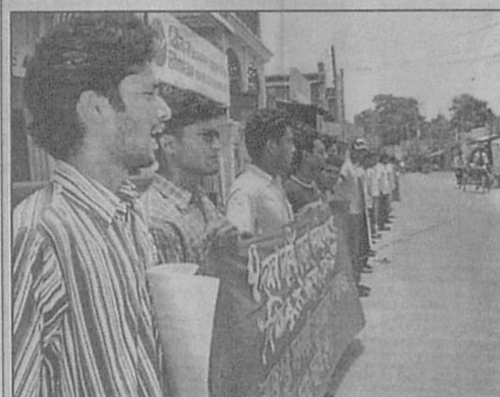
Students of Dinajpur Government College formed a human chain in the town yesterday to press their 7-point demand.

However, a section of teachers and employees aligned with some opposition parties oppose the move.