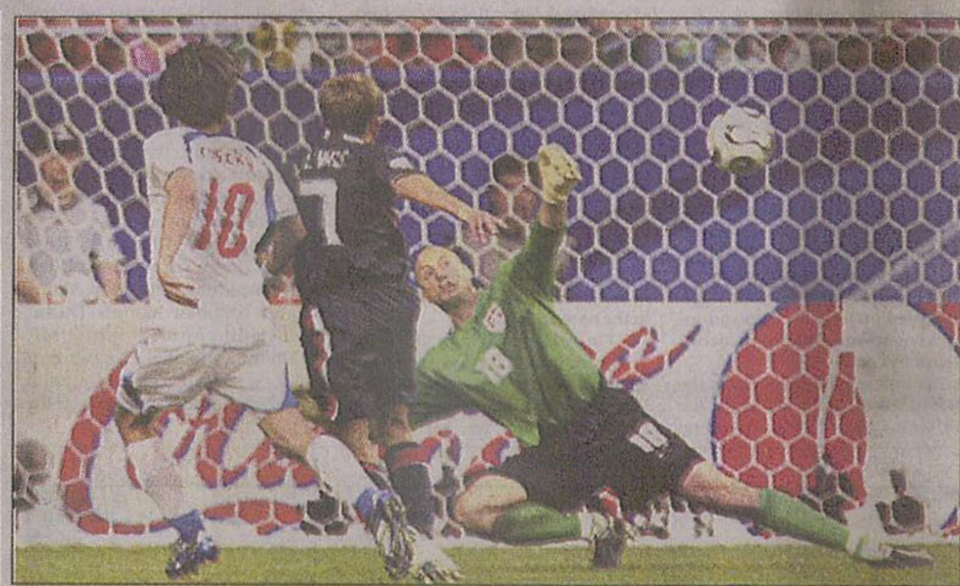
Czech midfielder Tomas Rosicky, left, scores his second goal during the World Cup 2006 Group E match between Czech Republic and USA in Gelsenkirchen, Germany.

The 14-party opposition combine enforces a countrywide 36-hour shutdown from 6:00am today to 6:00pm tomorrow to press home its demands for electoral reforms, resignation of the chief election commissioner (CEC) and two 'politically appointed' election commissioners. The hartal was called soon after the Awami League (AL)-led combine's 9:00am to 5:00pm Dhaka siege on Sunday also to protest 'police atrocities' on opposition leaders and workers during the siege programme that saw clashes between the law enforcers and opposition men, leaving around 500 injured. Hospitals, drug stores, fire brigade, vehicles of journalists and ambulances will remain out of the purview of the hartal. SEE PAGE 15 COL 1