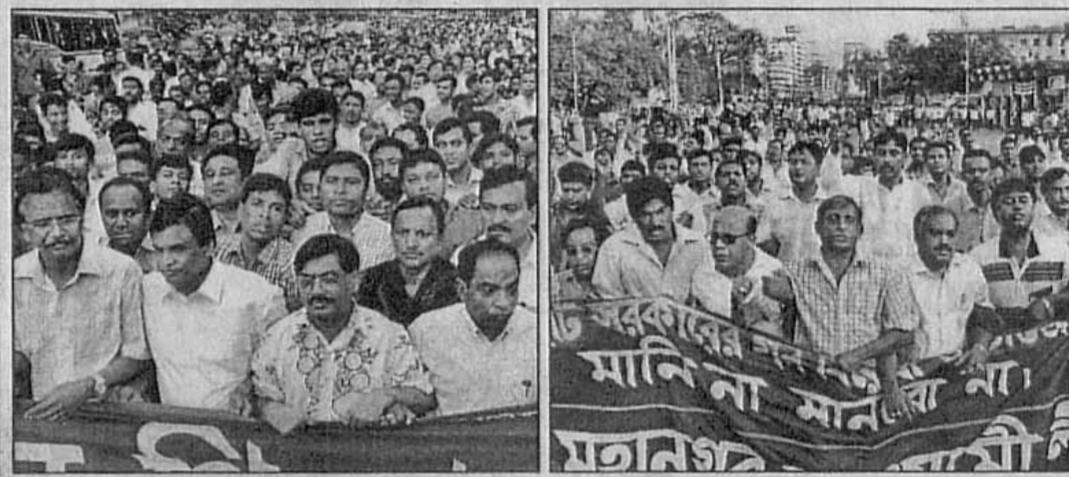
Dhaka City BNP, left, takes out a procession yesterday hailing the proposed budget for 2006-07 while City Awami League, right, stages a demonstration against the budget, terming it 'anti-people'.