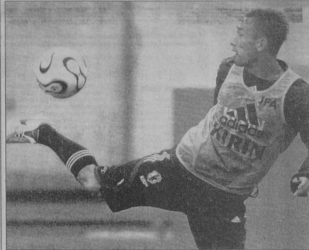
Japan's midfielder Hidetoshi Nakata traps a ball during a rainy training session at the North Sport Park in Bonn on Monday.

Japan will test their first-choice line-up against Germany, expected to be without midfield superstar Michael Ballack and defender Robert Huth through ankle injuries.