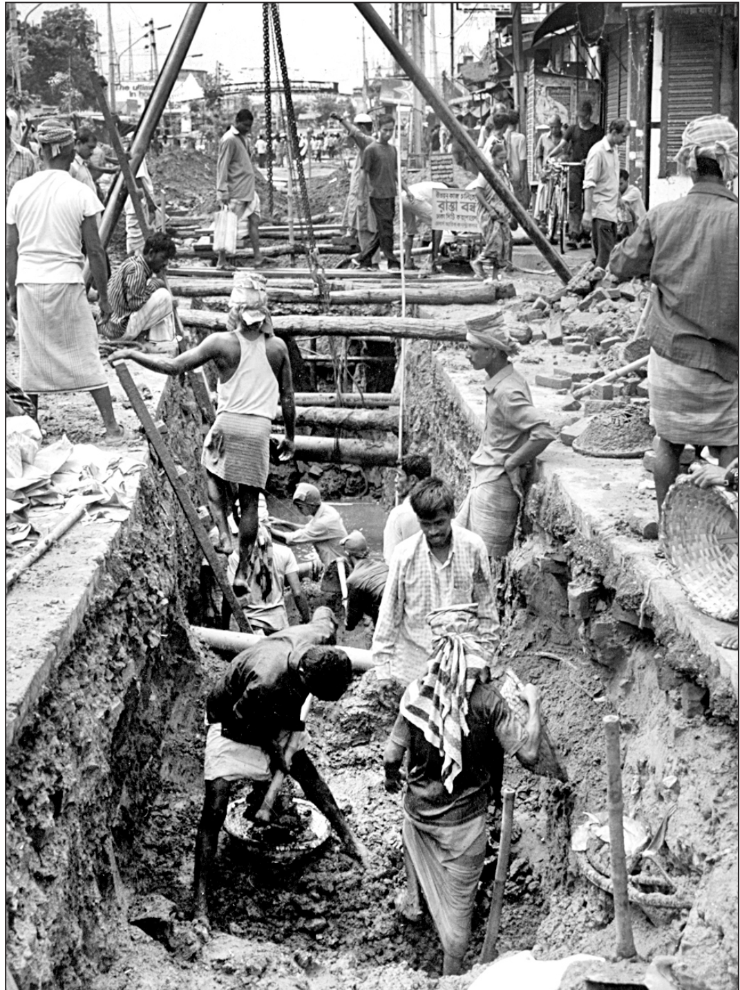
Road digging work continues at a slow speed at Dayaganj in the city, causing inconvenience to commuters as well as pedestrians.

Ratan was killed on this day in 1988 by Shibir cadres. Bangladesh Chhatra Maitri has been observing the day as anti-fundamentalism and anti-communalism day.