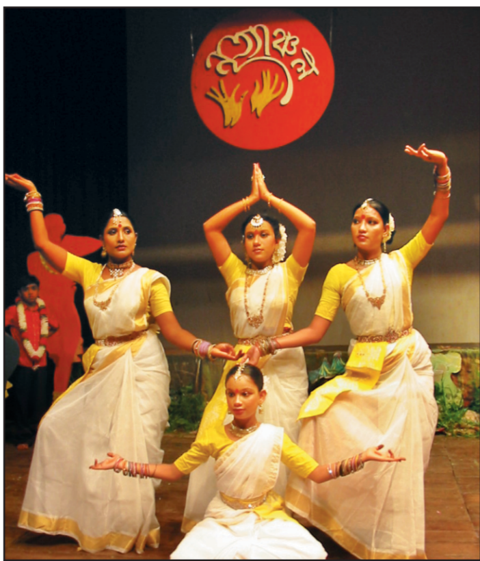
A group dance presentation by the students of Nrityanchal

Performances included, dance -- solo and group along with vocal and instrumental music both by junior and senior students of the Academy. The dancers performed Bharatnatyam, Kathak, traditional and other folk forms. A variety of dance styles provided the casual visitors the ideal opportunity to grasp the splendour and subtlety of a living