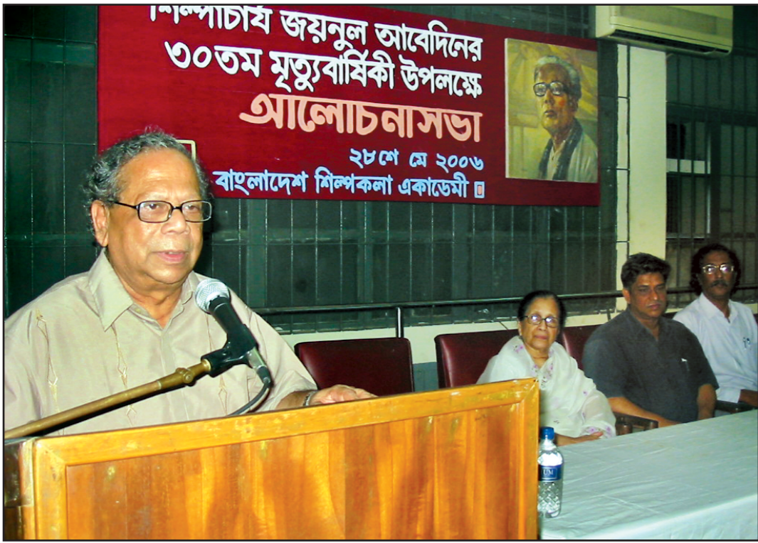
Eminent artist Murtaja Baseer speaking at the programme