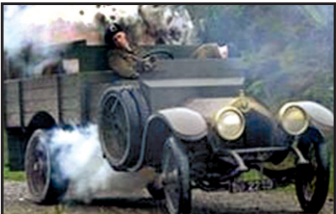
A scene from The Wind That Shakes the Barley