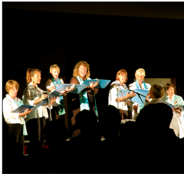
Morning Sky, an all women's singing group; participated in a concert at the Radisson Water Garden on May 27 with the Jago Arts dancers and Cantemus, a mixed choral group.

The glitzy dance show became more enjoyable when a comical dance item named Safdar doktor was presented. The dance Chol chol chol , was one of the most fascinating pieces of the show. Different ethnic and traditional music instruments complemented the brightly attired dancers. The concluding dance number of the event, titled Jonmohumi gave a fascinating glimpse of Bangladeshi rich dance heritage. The dance event ran for two hours. More than 150 students participated in the colourful dance event.