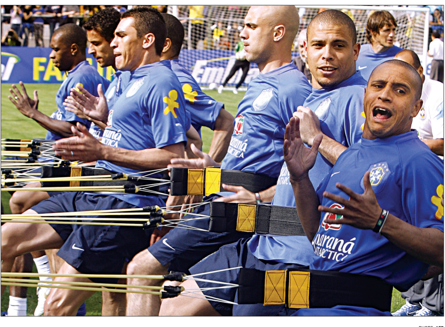
Brazilian footballer Roberto Carlos (R) screams while teammate Ronaldo (2nd from R) looks on as they go through stretching during a morning training session in Weggis on Friday.