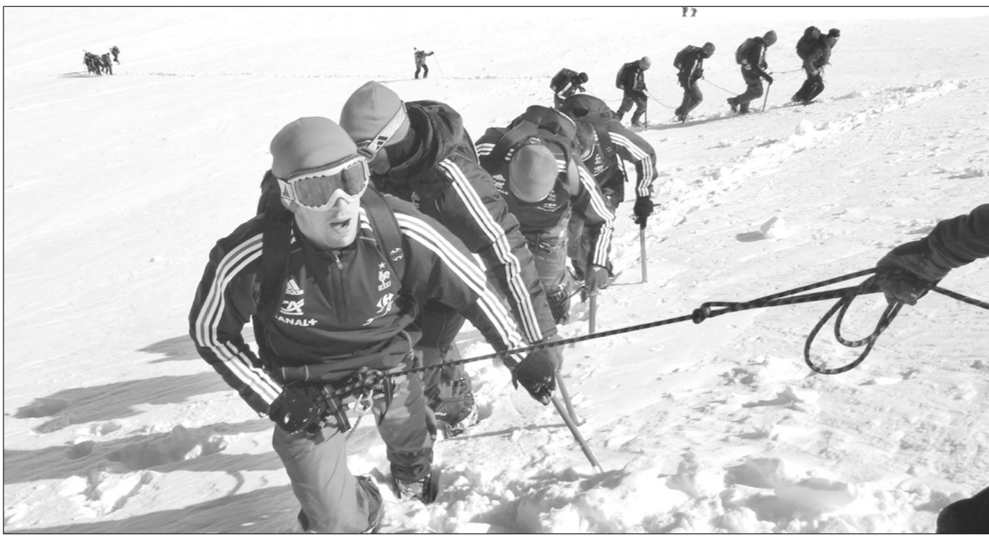
French players led by Franck Ribery (top) participate in a mountain trekking session as part of their training in the city of Tignes in the Swiss Alps on Wednesday.