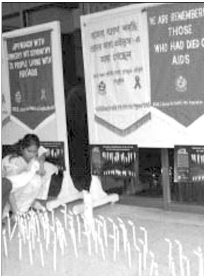
International AIDS Candlelight Memorial Day is observed every year in Dhaka by various organisations.