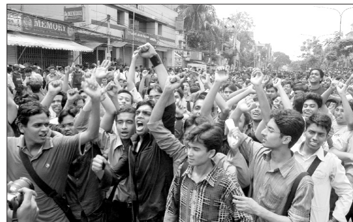
Recent student outbursts could have been prevented if UGC recommendations were implemented.