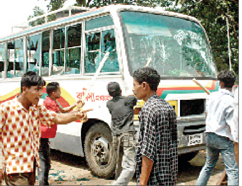
FROM LEFT... Agitated garment workers set fire to a fire engine which rushed to Savar to put out the flames in Little Star (Diamond) Spinning Mill; factory workers bring out a procession with sticks in their hands barricading Dhaka-Mymensingh highway in Gazipur; in the capital workers set ablaze three cars on the premises of a factory at Tejgaon; workers damage a bus in Tongi area.