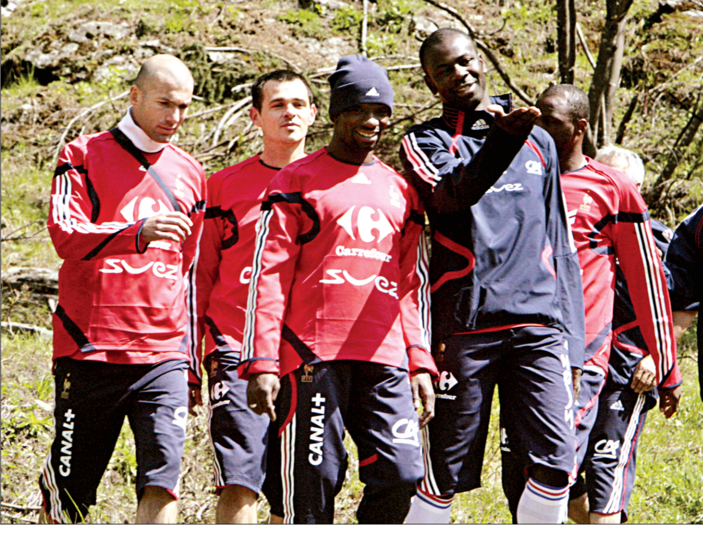
French players (from L-R) Zinedine Zidane, Willy Sagnol, Claude Makelele and Lilian Thuram attend a Fartlek session on the first day of their training camp on Monday in the French Alps city of Tignes.

TEN Sports India v West Indies Third ODI Live at 7:35 pm