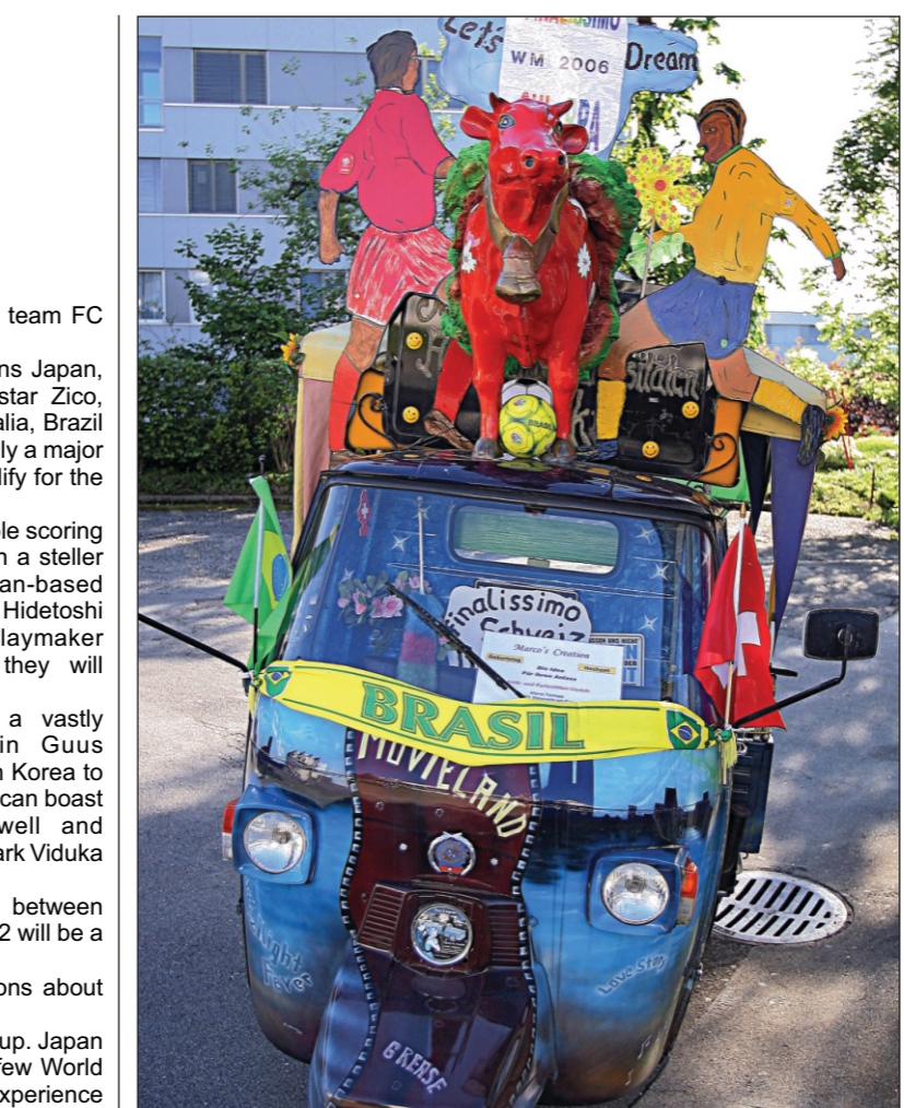
A classic Romiseta decorated with typical Swiss and Brazilian symbols is parked outside a gas station in the city of Weggis, Switzerland on Sunday. The city is preparing to welcome Brazil's World Cup team.