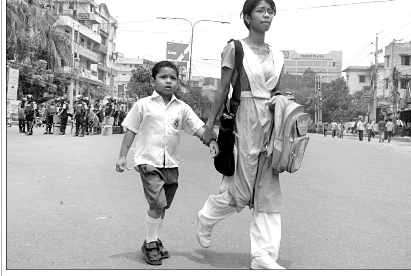
Two students walk to their schools as the road from Science Laboratory to Asad Gate in the city was closed to traffic during the siege programme of Jubo Sangram Parishad. The Parishad was scheduled to lay siege to the Election Commission Secretariat yesterday to press their demand for immediate cancel-

A citizens' condolence meeting will be held in memory of the victims of launch mishap of 2004 at the central Shaheed Minar at 4:45pm.