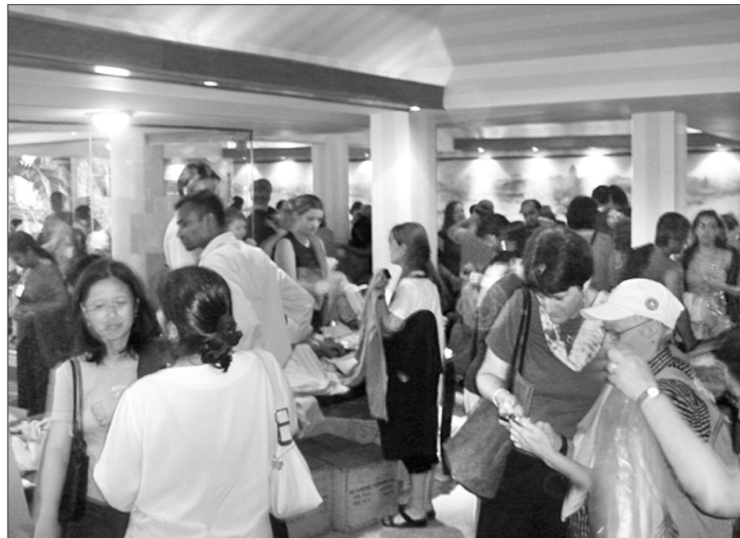
Crowds that thronged the Charity Sale organised by a group of five expatriate ladies in aid of the Islamia Eye Hospital at the Heritage Restaurant in Gulshan on Friday.

Islamia Eye Hospital and M A Ispahani Institute of Ophthalmology, a non-profit organisation offering treatment at no or low cost to the patients since its inception in 1960 and since then has continued to work in collaboration with different international organisations like Sight Savers, an International NGO, Orbis International,