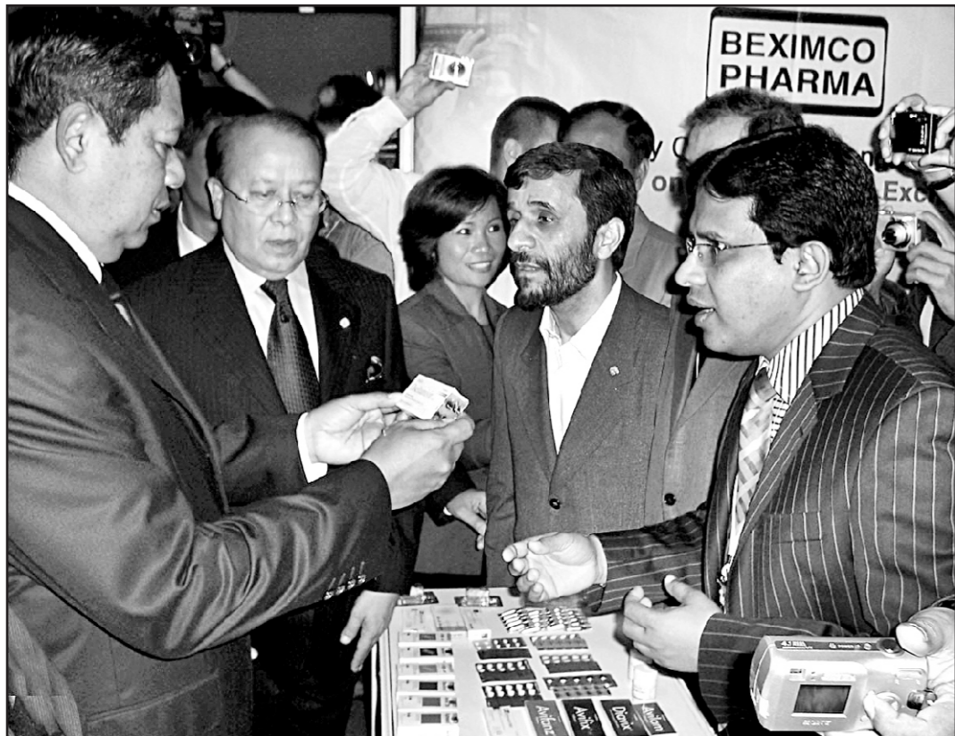
Indonesian President Susilo Bambang Yudhoyono, Iranian President Mahmoud Ahmadinejad and Bangladesh Foreign Minister M Morshed Khan visit the Beximco Pharma stall during the recently concluded 5-day 'D-8 Trade Exhibition' held from May 9 to 13 in Bali, Indonesia.