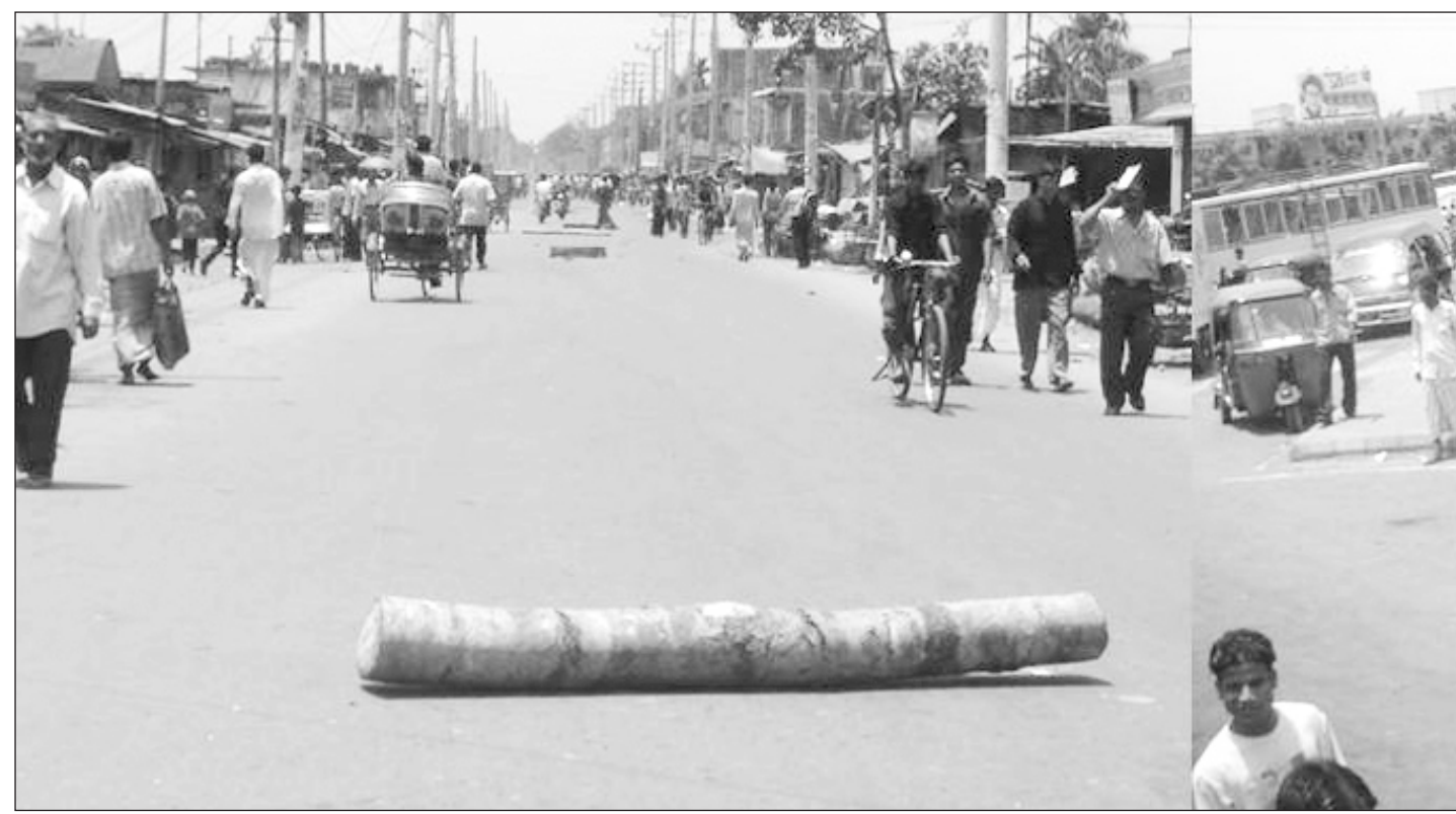
A road in South Surma in Sylhet city during the half-day hartal yesterday, called by local traders association.