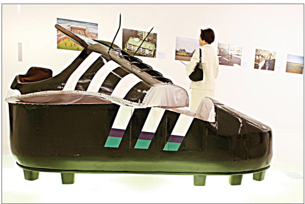
A coffin from Ghana shaped as a soccer shoe is presented in the exhibition "Football: One Game - Many Worlds" in Munich's Stadtmuseum on Thursday.