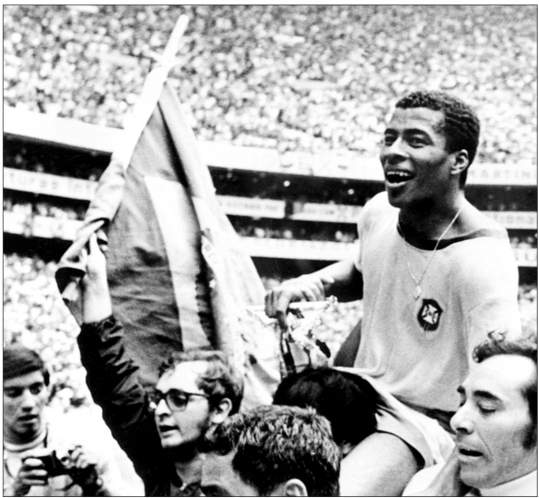
Brazilian forward Jairzinho is carried by fans after Brazil defeated Italy 4-1 in the World Cup final on June 21, 1970 in Mexico City. It is Brazil's third world title after the first two won in 1958 in Sweden and 1962 in Chile.