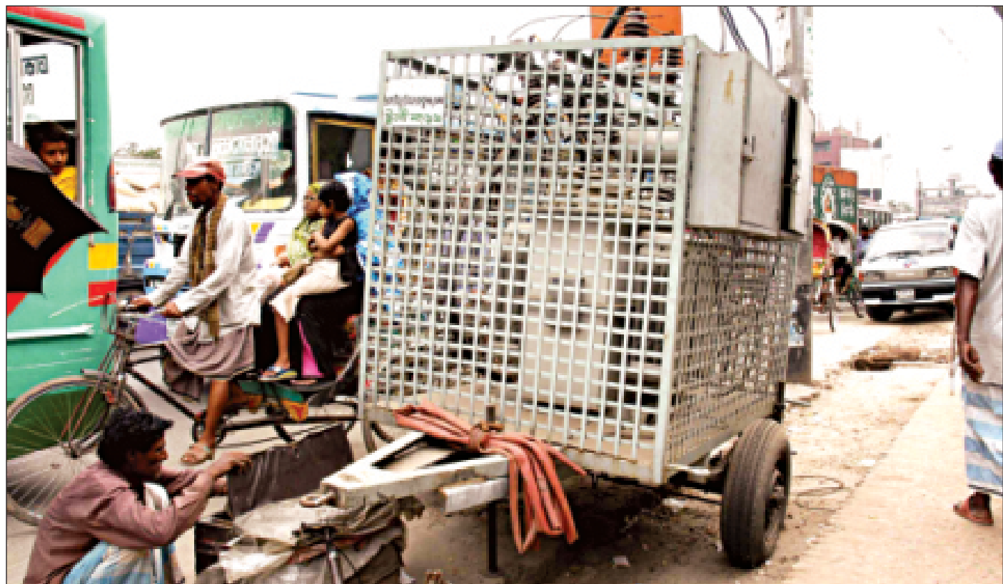
This is one of the portable power transformers Desa has stationed in the city's Demra area to pacify the power-starved angry locals. But the way it is parked on a North Jatrabari thoroughfare poses high risk of electrocution and other accidents in this storm-prone season.