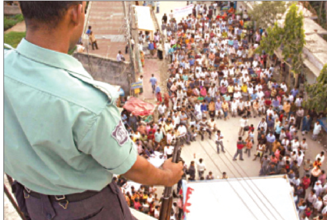
A policeman watches over a demonstration by the residents of Demra and Shyampur areas at Shanir Akhra in the city in demand of smooth power and water supply yesterday.

AFP, Paris Astronomers reported they had found three enticing Neptune-sized planets orbiting a distant star, in a discovery that marks a further step towards the goal of finding another Earth. More than 170 planets outside our own Solar System have been spotted in the past decade or so. But almost all of them have been gaseous Jupiter-sized giants that race around their star at a close range. Their atmosphere would be too scorching and too dense to have liquid water, an essential ingredient for life as we know it. In a paper published in the British journal "Nature", a team led by Christophe Lovis from the Geneva Observatory in Switzerland located a smaller SEE PAGE 15 COL 1