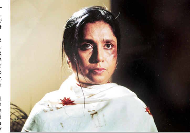
Ferdousi Majumdar in a scene from the documentary

National Award winning documentary Jibon O Abhinoy: Ferdousi Majumdar will be aired today at 1:05pm on ATN Bangla. The documentary, planned and directed by Abdullah Al Mamun, highlights the accomplishments and life of noted theatre and TV actress Ferdousi Majumdar. In the Bangladeshi acting scenario Ferdousi has attained an iconic status for her immense contribution to theatre. During her decades-spanning career she has been involved with radio, theatre, television and the silver screen. This multifaceted actress has impressed the audience with her diverse roles in several TV plays and serials. In the documentary Ferdousi talks about the interesting incidents in her life. From the vast array of TV serials she has done, clips from her ten best serials have been included in the documentary. The documentary also features noted actors Ramendu