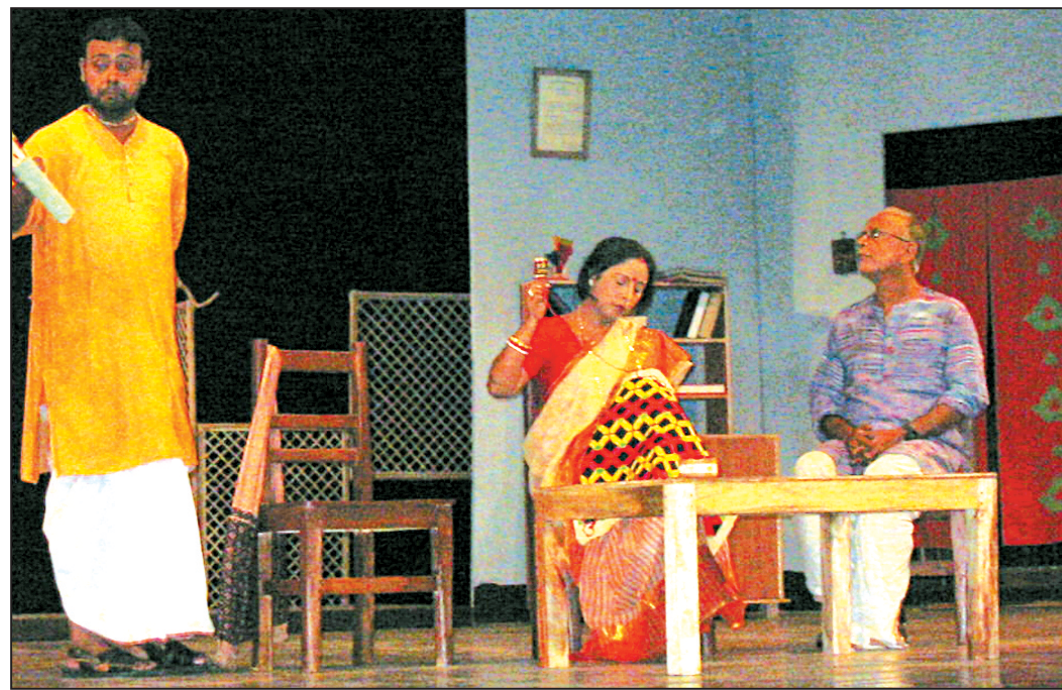
A scene from Bhattiprostor