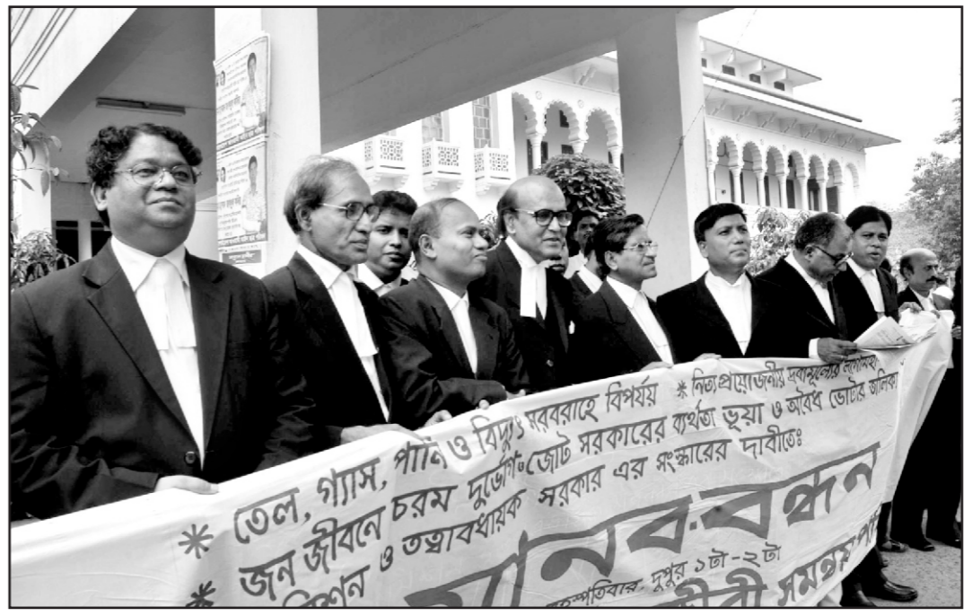
Sammita Ainjibi Parishad forms a human chain on the High Court premises in the city yesterday protesting the government's failure to supply gas, water and electricity to people.

After the inaugural session, a rally was brought out from Shipakala Academy to Municipality auditorium where the council was held.