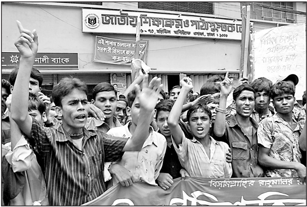
Bangladesh Bookbinding Traders' Association stages a demonstration in front of the National Curriculum and Textbook Board office in the city yesterday demanding that the Board allocate the work of bookbinding to genuine bookbinding firms.