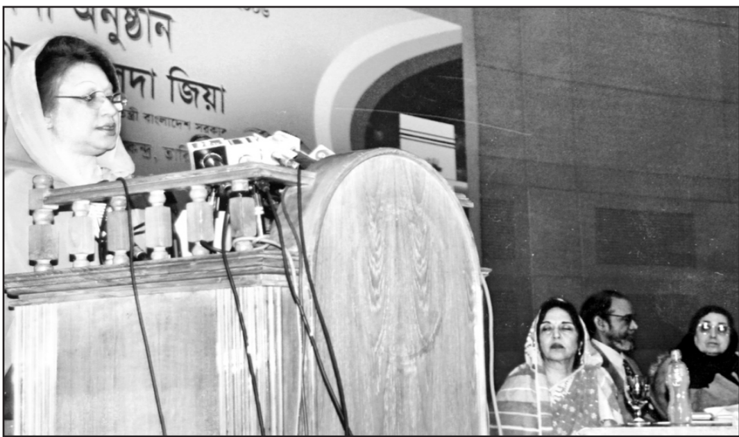
Prime Minister Khaleda Zia addresses the inaugural function of National Imam Conference 2006 at China-Bangladesh Conference Centre in the city yesterday.

Relatives, friends and admirers have been requested to attend the quikhwani and pray for salvation of the departed soul.