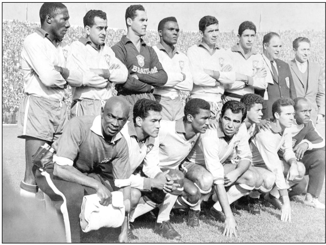
The Brazil team line up for an official photograph ahead of the World Cup final against Czechoslovakia on June 17, 1962 in the Nacional Stadium in Santiago, Chile.