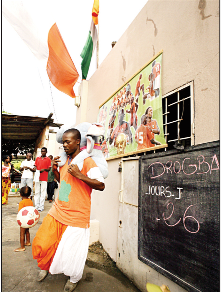
An Ivory Coast supporter plays with a ball on Monday in Koumassi, a popular district of Abidjan, in front of his home decorated with pictures of Elephants, an Ivory Coast flag and a board showing the number of days left for their first match in the World Cup.