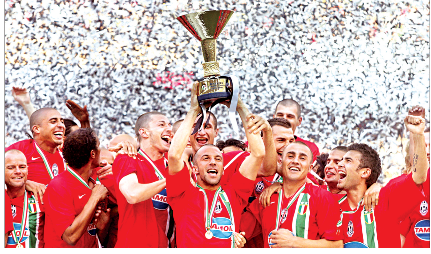
Juventus captain Alessandro Del Piero (C) holds aloft the Serie A title at the San Nicola stadium in Bari on Sunday. Juventus beat Reggina to claim their second consecutive league championship.