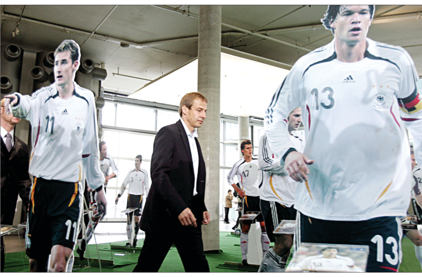
Germany head coach Juergen Klinsmann walks among card board reproductions of German players Miroslav Klose (L) and Michael Ballack (R) prior to announcing his squad for the World Cup at a press conference in Berlin on Monday.

SQUAD Goalkeepers: Dida (AC Milan), Julio Cesar (Inter Milan), Rogerio Ceni. Defenders: Cafu (AC Milan), Cicinho (Real Madrid), Lucio (Bayern Munich), Juan (Bayer Leverkusen), Roberto Carlos (Real Madrid), Gilberto (Hertha Berlin), Cris (Olympique Lyon), Luisao (Benfica). Midfielders: Edmilson (Barcelona), Juninho Pernambucano (Olympique Lyon), Emerson (Juventus), Ze Roberto (Bayern Munich), Gilberto Silva (Arsenal), Kaka (AC Milan), Ricardinho (Corinthians). Forwards: Ronaldo (Real Madrid), Robinho (Real Madrid), Ronaldinho (Barcelona), Adriano (Inter Milan), Fred (Olympique Lyon).