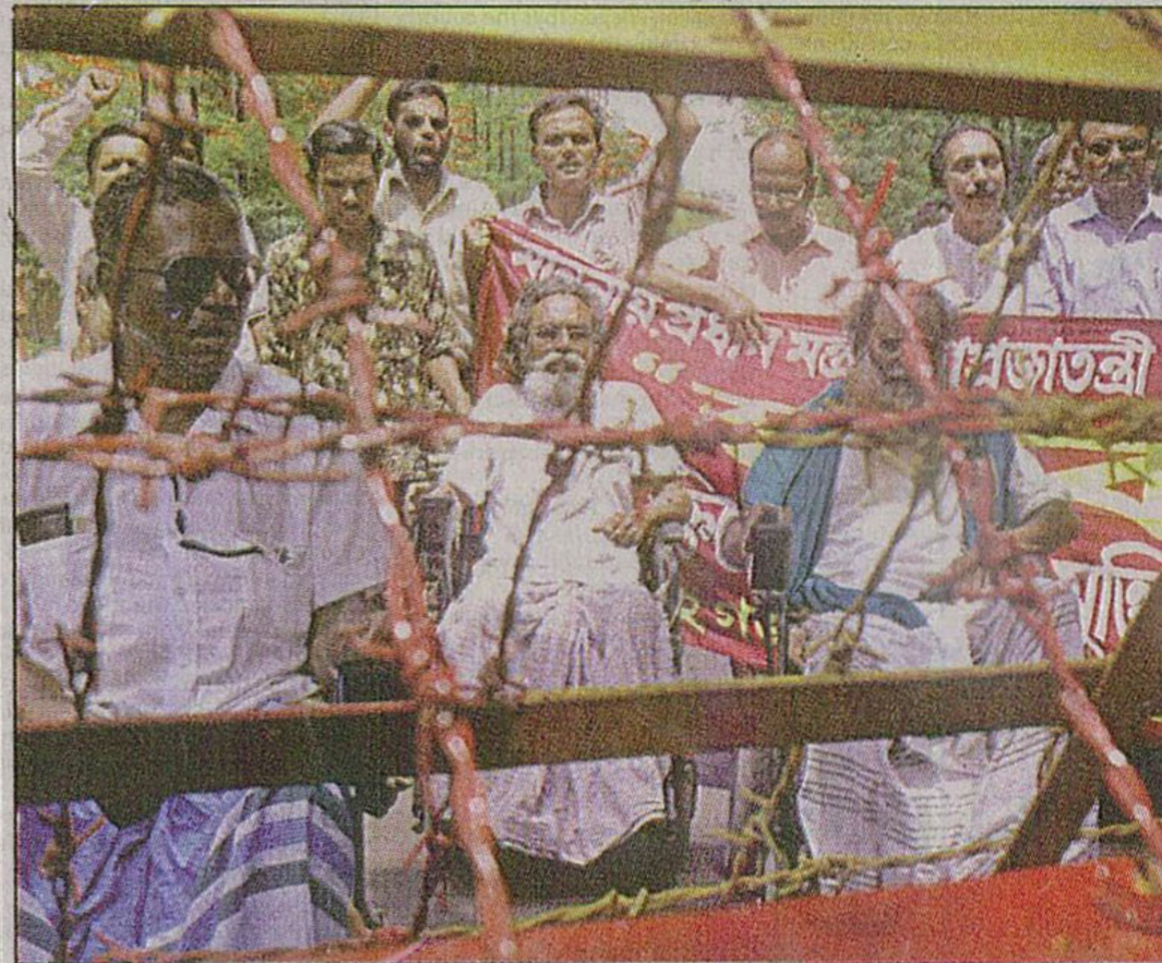
Police halt a procession of war-maimed freedom fighters and martyrs' families near Crescent Lake as it was marching towards the Prime Minister's Office yesterday to submit a memo on their five-point demand.