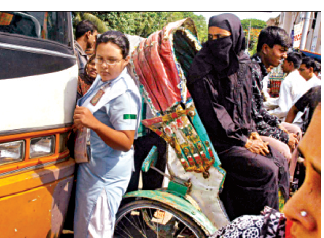
An HSC examinee struggles to make her way through the gridlock in the city streets as the examinations begin vesterday across the country.