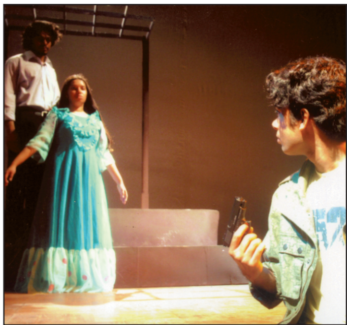
A scene from the play