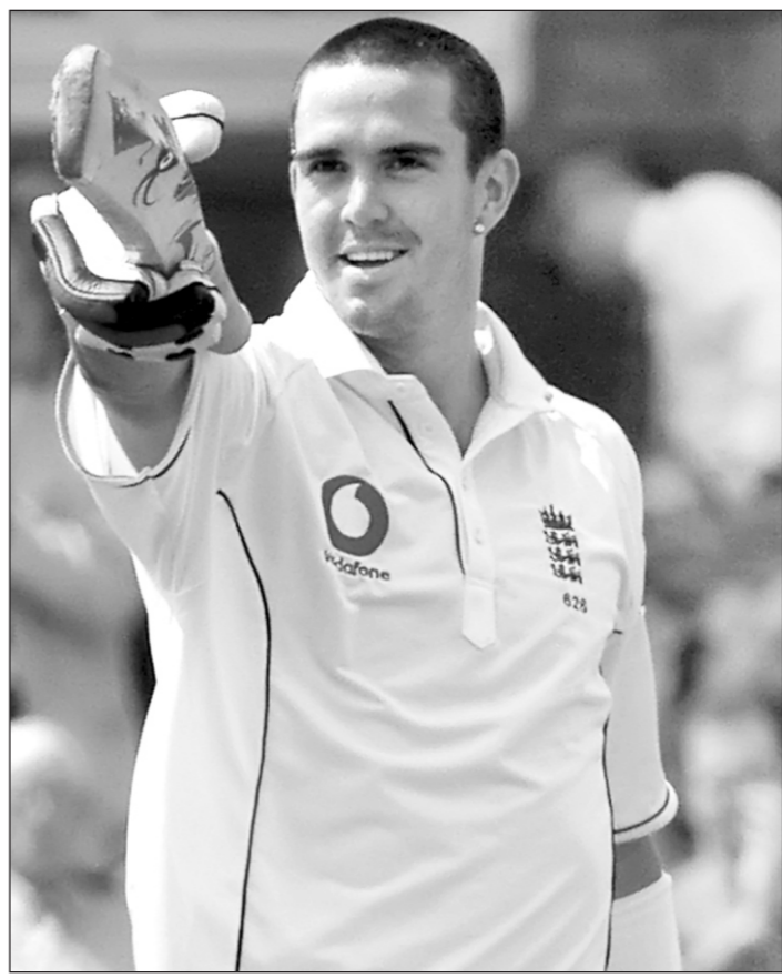
England batsman Kevin Pietersen celebrates his century against Sri Lanka on the second day of the first Test at Lord's on Friday.

"Players of that standard are always asking themselves questions," former France coach Jacques Santini said. "This is because they want to be excellent all the time."