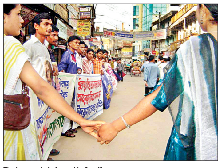
The human chain formed in Comilla

A CORRESPONDENT, Comilla A human chain was formed recently at the Pubal Chatter in the town in demand of holding the national programme of Poet Kazi Nazrul Islam's 107th birth anniversary in Comilla. Members of Nazrul Parishad, Comilla, representatives from different socio-cultural organisations, students and intellectuals attended the event with banners.