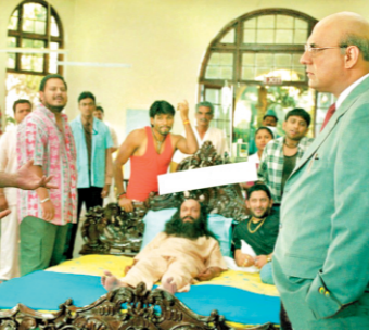
A scene from Munnabhai MBBS

The sequel to Munnabhai MBBS is ready for release on August 25 this year. The much-hyped film has a tentative title: Munnabhai Lage Raho. Apparently, producer Vidhu Vinod Chopra was keen on the name Munnabhai 2nd Innings. However he had to give way as a poll showed that people preferred Munnabhai Lage Raho.