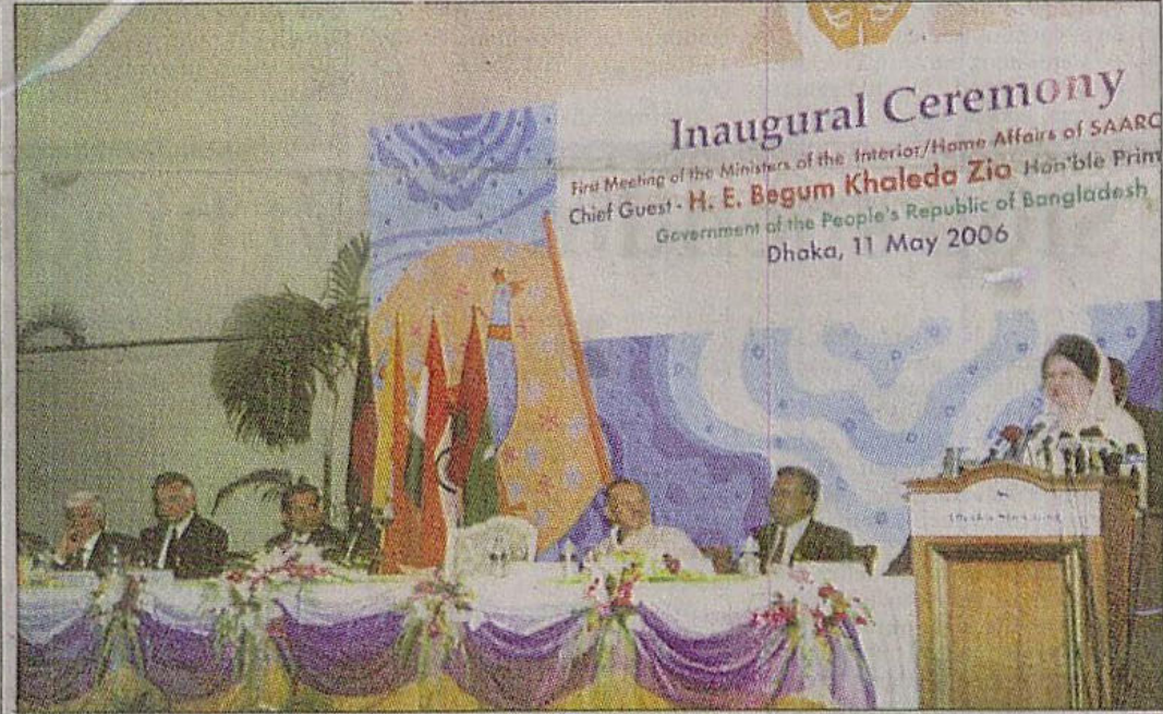
Prime Minister Khaleda Zia speaks at the first meeting of the Saarc home ministers at Dhaka Sheraton Hotel yesterday.