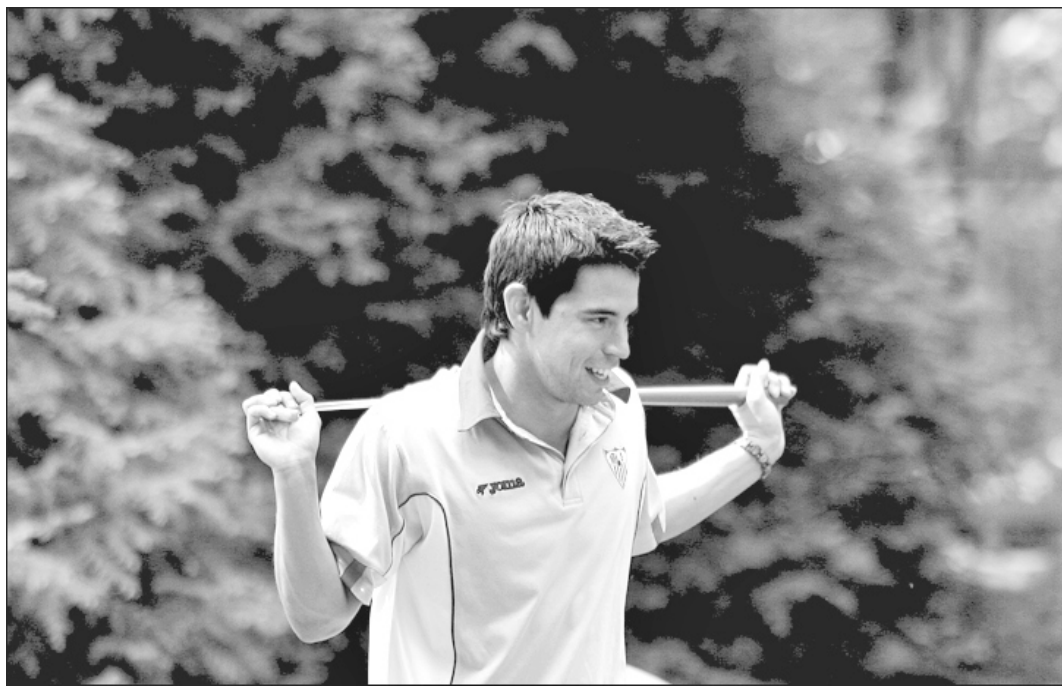
Argentina and Sevilla striker Javier Saviola playing mini golf on Monday in Oisterwijk near the Dutch city of Eindhoven.

WP O PRCCNS XRMA OZXJV OZK VRCCA OM TWA OGMN LNQWCR, SNGCK VNG BOCC TWL O BOJ-QRJOMRJ? Yesterday's Cryptoquip: WHEN A PERSON GOES FISHING, I SUPPOSE HE COULD BE WIELDING WEAPONS OF BASS DESTRUCTION. Today's Cryptoquip Clue: C equals L The Cryptoquip is a substitution cipher in which one letter stands for another. If you think that X equals O, it will equal O throughout the puzzle. Single letters, short words and words with an apostrophe give you clues to locating vowels. Solution is by trial and error.