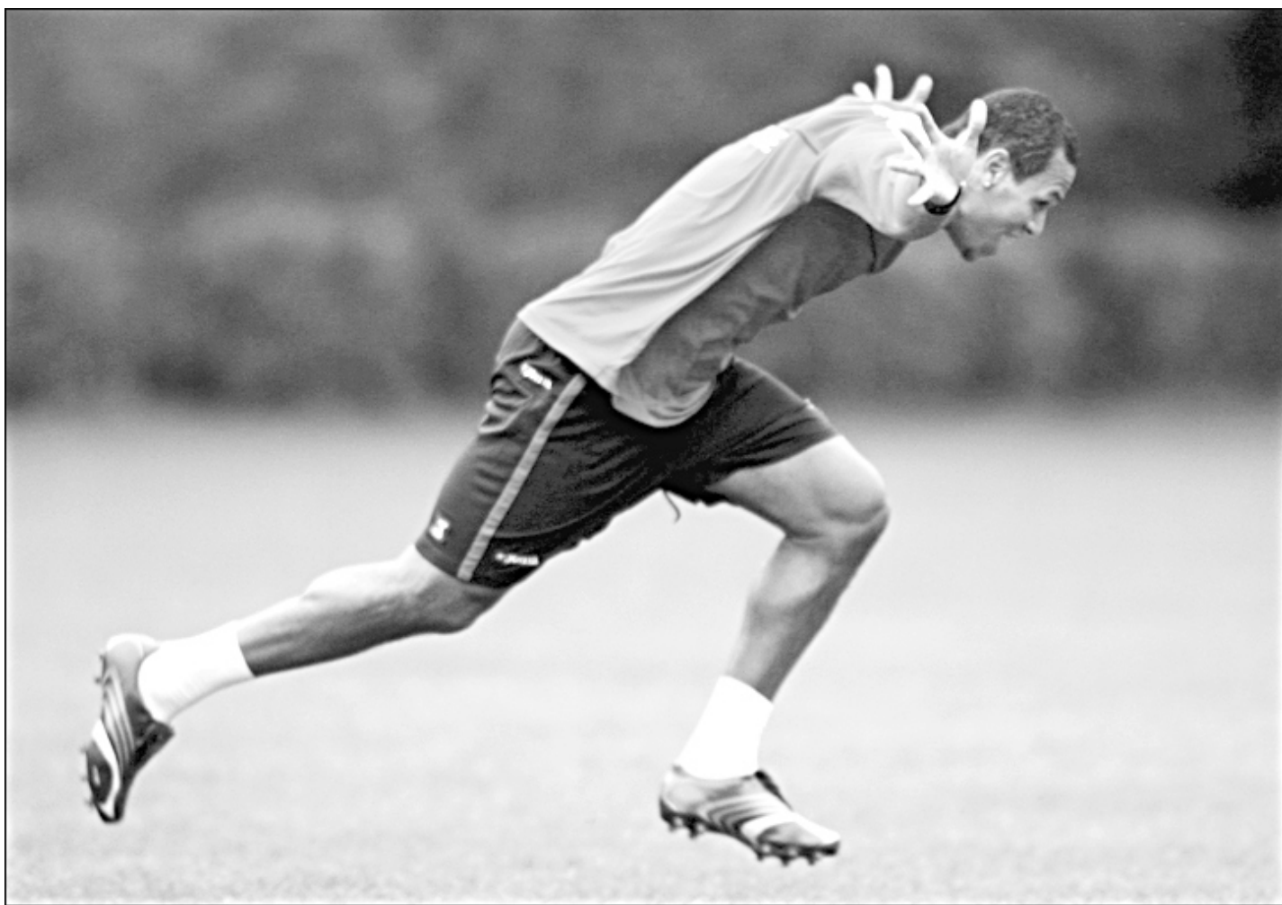
Sevilla striker Luis Fabiano runs in a training session at Oyster Wijk, near Eindhoven on Monday on the eve of their UEFA Cup final against Middlesbrough.