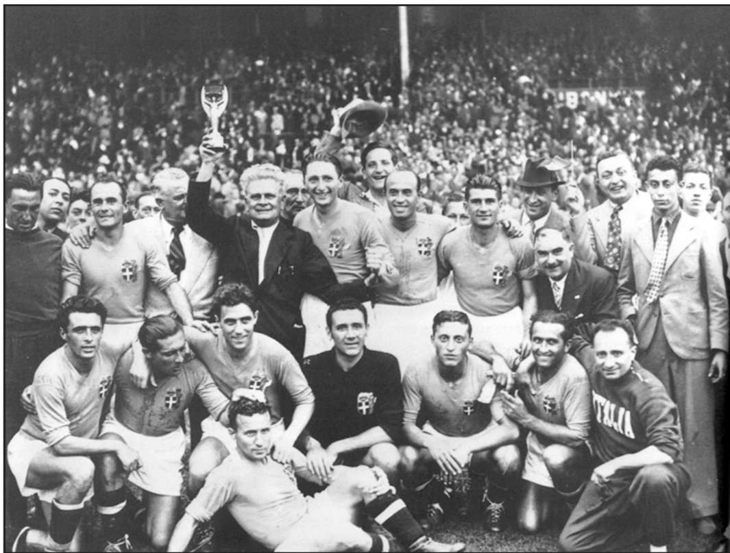
ON TOP OF THE WORLD AGAIN: Master coach Vittorio Pozzo holds the Jules Rimet trophy at the Yves du Manoir stadium in Colombes in the suburb of Paris on June 19, 1938 as Italy clinch the World Cup for the second consecutive time.