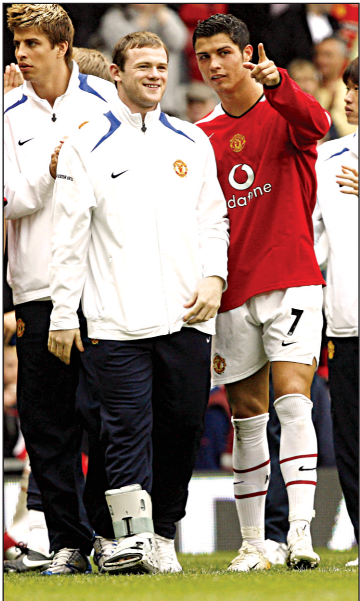
Wayne Rooney, with his ankle in a cast, shares a light moment with teammate Cristiano Ronaldo after the match against Charlton on Sunday.