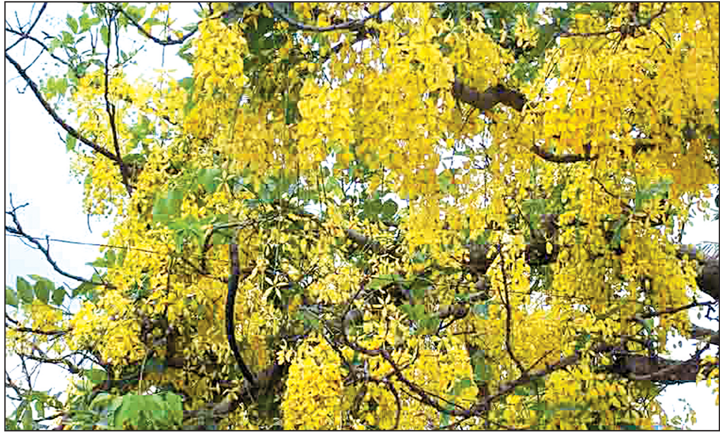
A soothing sight in a concrete jungle... Once in plenty, the big flower tree locally called shonali is now rare in Comilla town. The lone tree at Kandirpar in the heart of the town was snapped by Zakir Azad.

They said they did not get any assistance from the government.