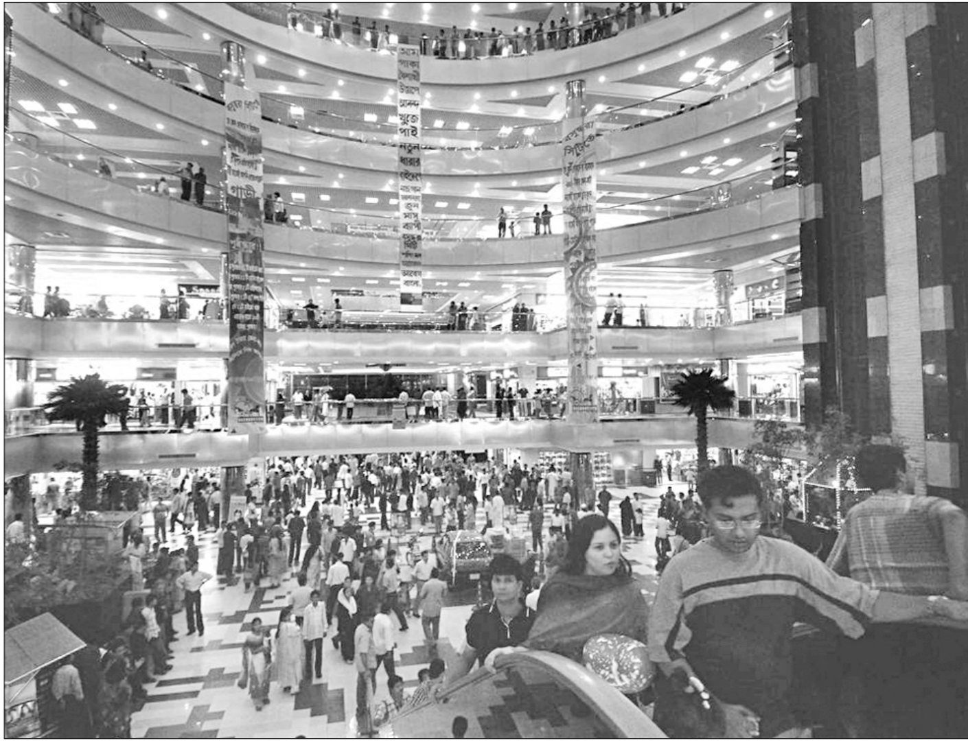
The view of a crowded posh shopping mall sans bookshops, in the city.

not haunt posh malls is because there are some markets specialised for books -- like New Market, Nikhet and Aziz Super Market. These are well known for books," said Mamun, a Dhaka University (DU) student. A rent of a small shop at Aziz Super Market costs only Tk 4,000 to 6,000 and the spacious ones between Tk 10,000 to 12,000 a month. The shop rents in New Market is Tk 1,425 only. These rents are lower and affordable to bookshop owners. "Bookshops of Aziz Super Market import books. If I go there I will find an array of new books which are not available in the bookshops of shopping malls," said Fairuz, another DU student. "My father had two bookshops in the stadium market but the number of the customers decreased when electronics crept in," said Nipa Khaleed, owner of Ideas, a creative boutique in Aziz Super Market. "The shops were there from 1960 to 1995 but gradually my father moved to this market. At that time many famous personalities like Mamtazuddin Ahmed and Asaduzzaman Noor visited his shops and gathered there in the evenings," said Nipa. "My father imported books and the shops were always bustling with customers," she said. "The reading habit is dying and this is one reason the glittering malls do not contain bookshops," said Nipa regretfully.