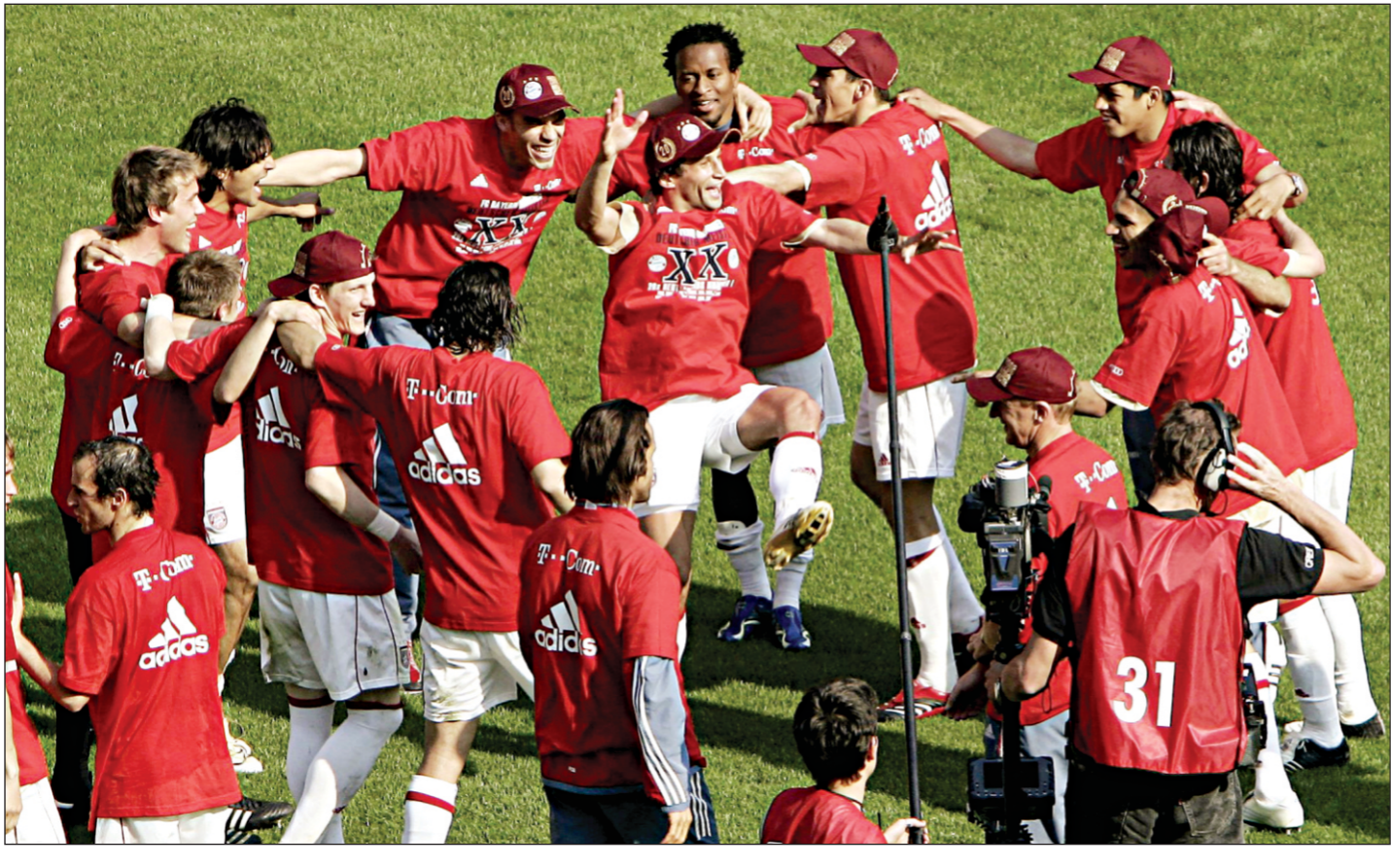
Bayern Munich players celebrate their second successive Bundesliga title triumph at Kaiserslautern on Saturday. They confirmed the championship with a match in hand.

hope. But Ashwell Prince and Shaun Pollock took South Africa through to only their second win in nine Tests in an extended season. They lost five out of six Tests against Australia before taking on New Zealand. Vettori and Jacob Oram took their seventh wicket stand to 49 before Oram mistimed a drive against Dale Steyn and was caught by Dippenaar diving forward at mid-off. James Franklin provided more frustration for the bowlers as he and Vettori added 44 for the eighth wicket before the innings ended in a rush, with the last three wickets falling for no runs in six balls. Chris Martin was out first ball when he paddled a bouncer from Hall to Amla at backward square leg. South Africa won the first Test in SEE PAGE 18 COL 5