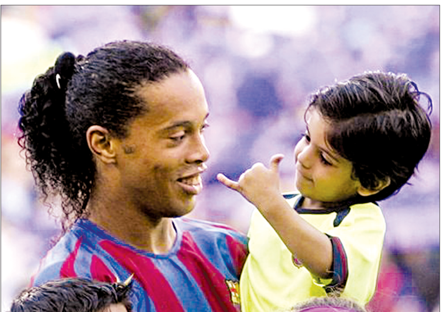
A young supporter shows Ronaldinho his trademark gesture before the Primera Liga match against Espanyol at Nou Camp on Saturday.

Mohammad Ashraful made an inauspicious debut at English club side Rainhill Cricket Club in the Merseyside and Southport Cricket Alliance First Division at the club ground on Saturday, according to the club's website. Coming into bat against Norley Cricket Club, the out of sorts batsman from Dhaka, made just 18 runs before falling to a brilliant catch. He also bowled ten overs and took a wicket, giving away 30 runs. Ashraful left for Dhaka last week to play club cricket in England for the first time in his career. He had an indifferent home season this year when he was successful against the Sri Lankans, against whom he scored a Test hundred as well as a couple of half-centuries but failed to score against Australia, much highlighted by poor shots and cries of mental fatigue.