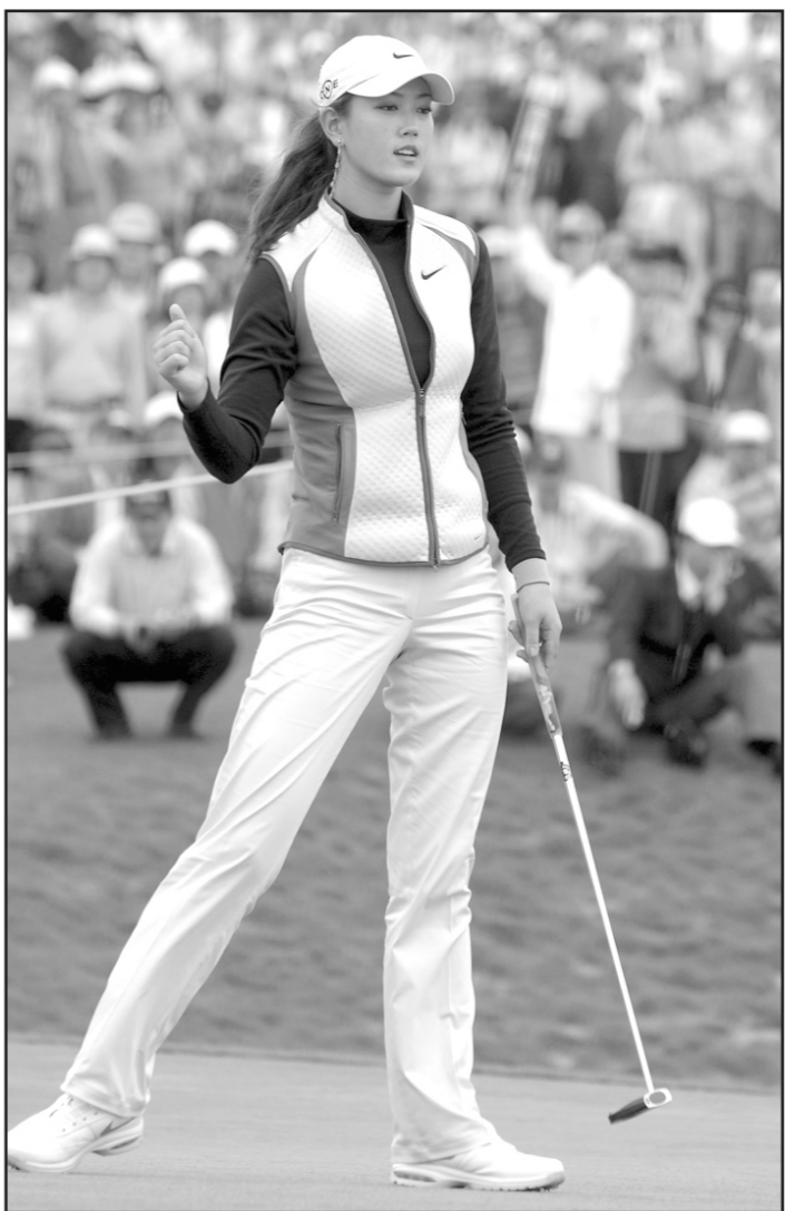
America's teenage sensation Michelle Wie pumps her fist after sinking a putt during the SK Telecom Open at the Sky Golf Club in Seoul on Friday.