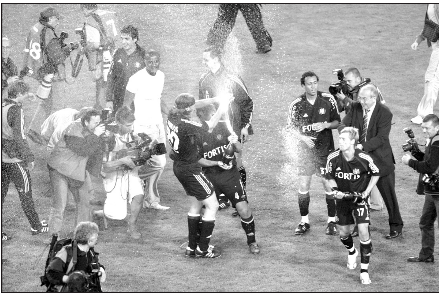
Anderlecht players celebrate their winning the Belgian league for the 28th time on Friday after defeating Zulte-Waregem 3-0.