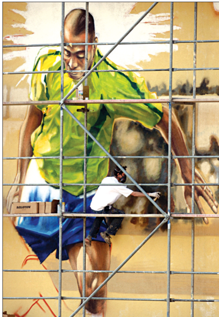
A graffiti artist paints a giant mural featuring a Brazilian football player on a wall in Berlin's Mitte district in preparation for the 2006 FIFA World Cup on Friday.