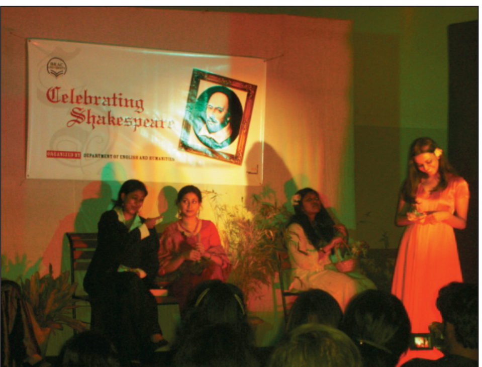
Students of BRAC University performing at the event

Shakespeare's birth anniversary (April 23, 1564) was celebrated with gusto in many countries. Nearer home, BRAC University recently observed the occasion with a colourful programme, titled 'Celebrating Shakespeare', says a press release.