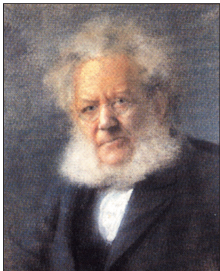
A portrait of Henrik Ibsen