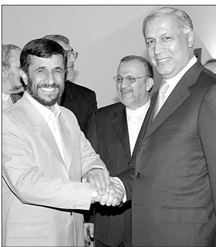
Iranian President Mamoud Ahmadinejad (L) shakes hands with Pakistani Prime Minister Shaukat Aziz prior to a meeting in Baku Thursday. The two leaders, who are in Baku to attend the 9th session of the Economic Cooperation Organisation (ECO) Summit, discussed the Iran-Pakistan-India gas pipeline project and Iran's nuclear issue during the meeting.

Already under fire from some retired military brass who want him to resign, Defence Secretary Donald H. Rumsfeld was greeted at a speech in Atlanta by unusually hostile anti-war protesters.