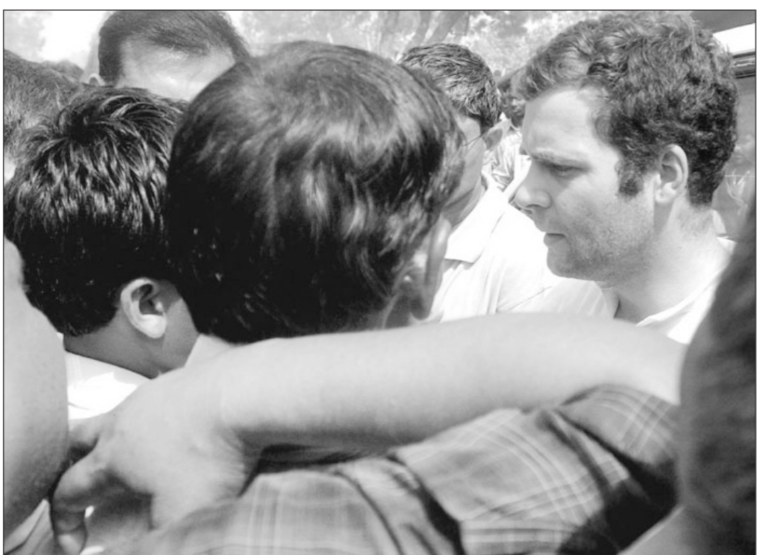
Rahul Gandhi, son of Sonia Gandhi, president of the Congress Party and Chairperson of the United Progressive Alliance (UPA) government, talks with supporters yesterday during election campaign for the by-polls scheduled to take place in Uttar Pradesh's Rae Bareilly constituency on May 8.

Palstinians, saying no progress in the stalled Middle East process is possible with radical Islamists Hamas in government.