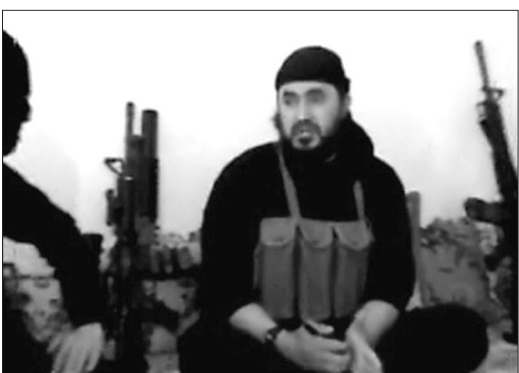
An undated video grab released on the website of the US Department of Defence (DOD) Thursday shows al-Qaeda's Iraq frontman Abu Musab al-Zarqawi with a masked comrade (L) at an undisclosed location in Iraq.

that letting it go ahead would take pressure off Hamas to renounce violence, recognise Israel and abide by interim peace deals. But they said the Bush administration has agreed to back an expansion of Abbas's elite presidential guard. The EU would provide the funds for training and equipment.