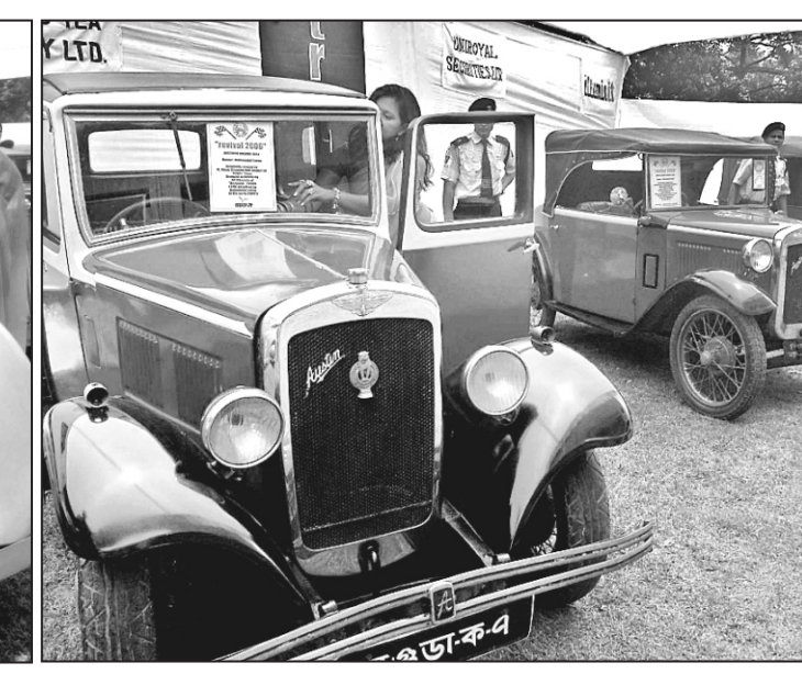
The Old Car Club Bangladesh organised a two-day vintage car exhibition on the premises of the National Museum in the city yesterday.