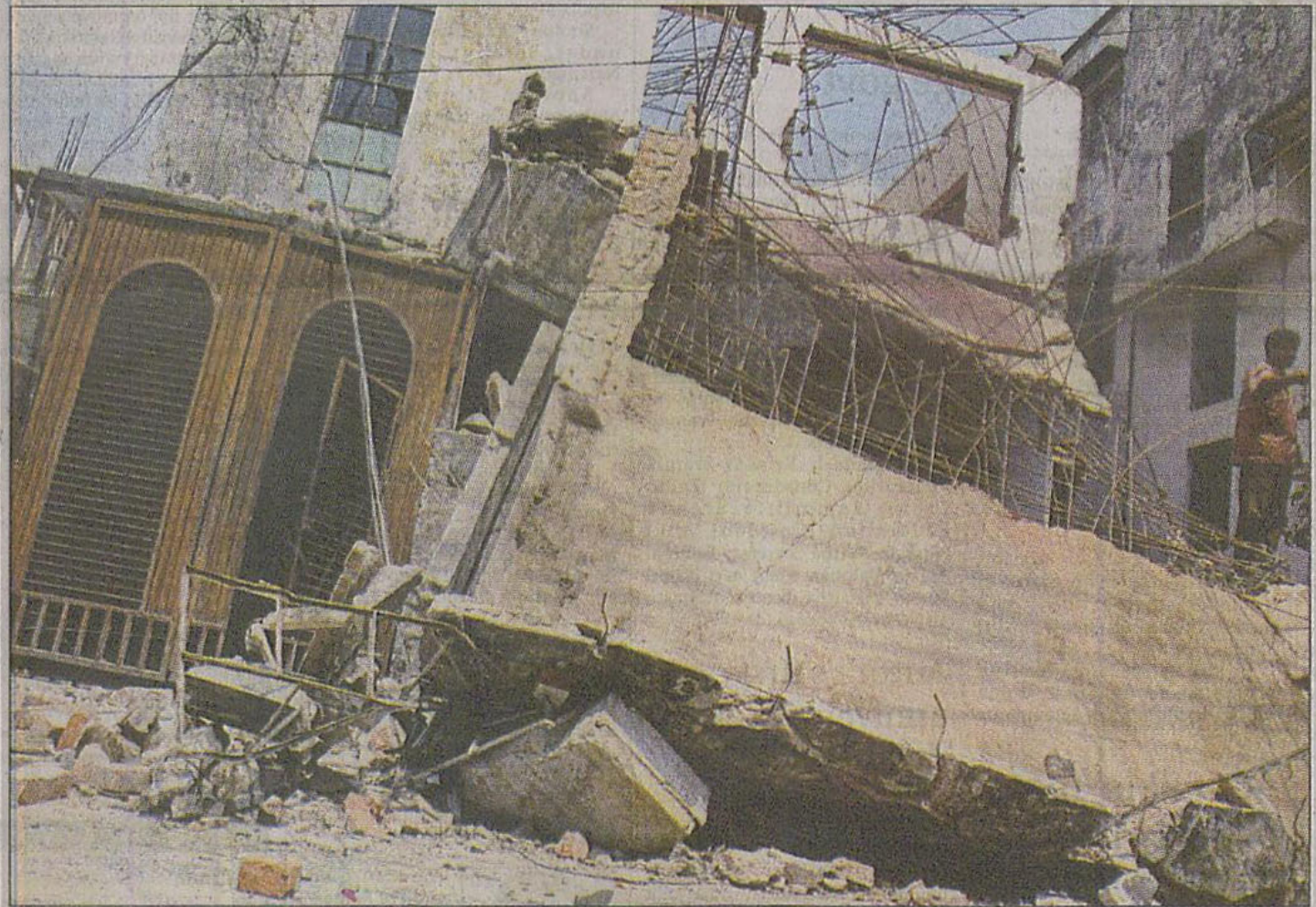
This chunk of the roof of a two-storey building in Tajmahal Road of Mohammadpur in the city fell on a car parked in front yesterday during its demolition to make room for a new apartment complex. Luckily, no one was hurt in the incident.

But, the firm did not provide authorisation letters of the companies it named as partners and financier in the project, the ministry pointed out in the letter.