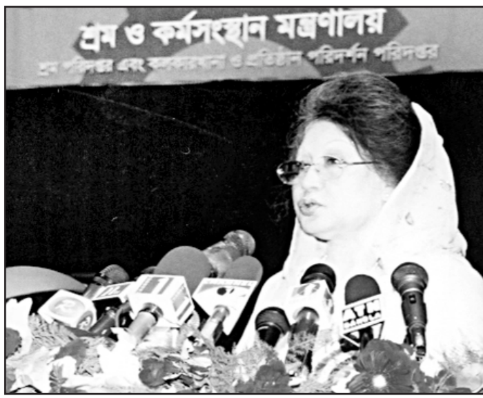
Prime Minister Khaleda Zia speaks at a discussion marking the May Day at Osmani Memorial Auditorium in the city yesterday.

The prime minister expressed the optimism that the nation will be able to attain prosperity through tapping its