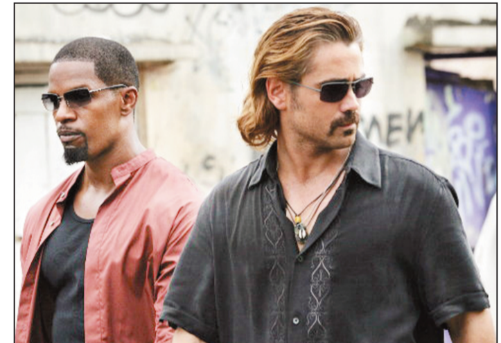
Jamie Foxx and Colin Farrell in a scene from the movie

Shooting for the movie is well under way and the movie is expected to release in July 2006.