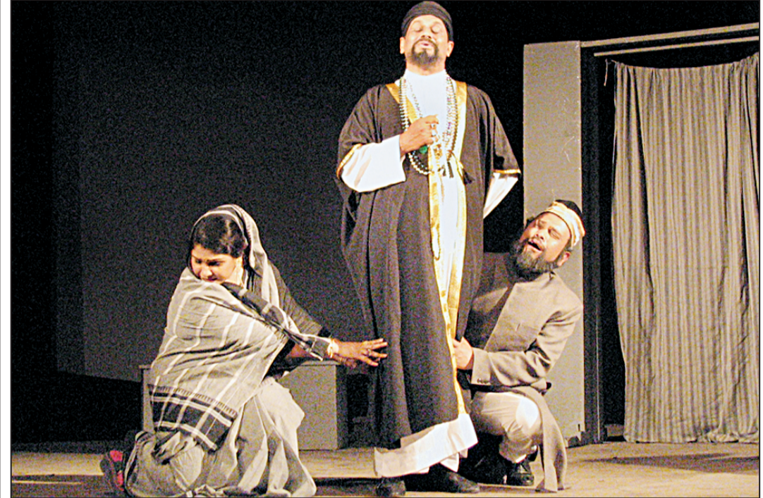
A scene from the play Ohe Tanchak