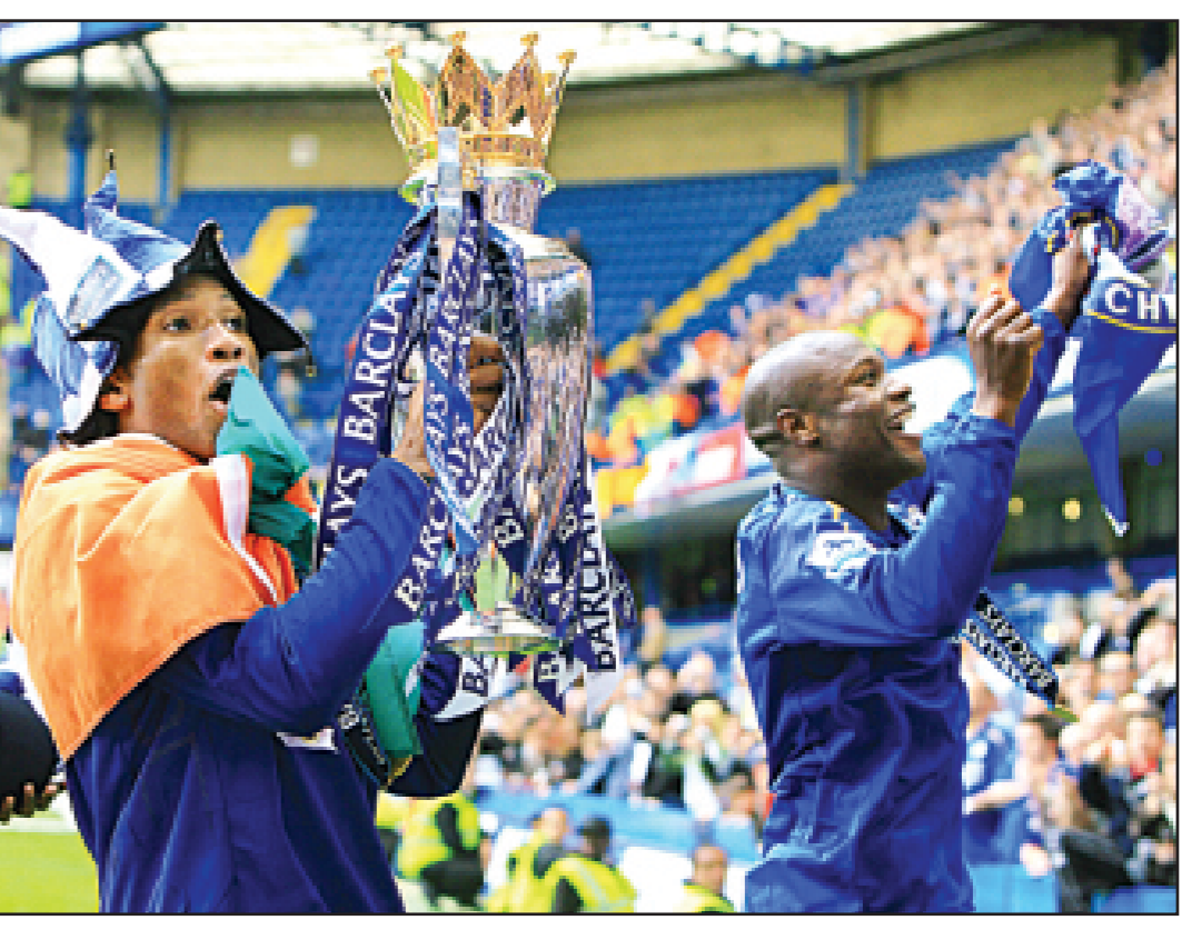
Chelsea players Didier Drogha (L) and Claude Makelele celebrate with the Premiership trophy after defeating Manchester United 3-0 at Stamford Bridge on Saturday.