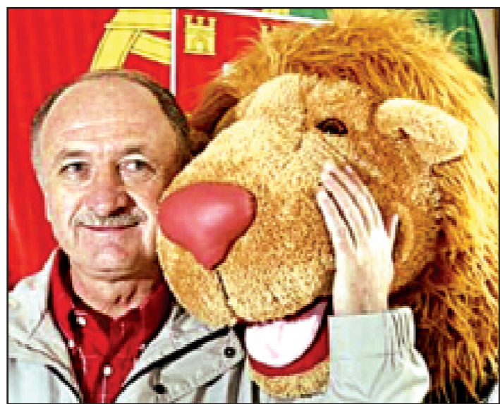
Portugal coach Luiz Felipe Scolari cuddles the 2006 FIFA World Cup mascot 'Goleo' after his tour through the sports hotel of 'Hotel Klosterpforte' where he will be staying along with his team during the tournament.

Tottenham are confident injured England centre-half Ledley King will be fit for this summer's World Cup finals in Germany. Both coach Martin Jol and assistant Chris Hughton believe the defender will have recovered sufficiently from a fractured metatarsal