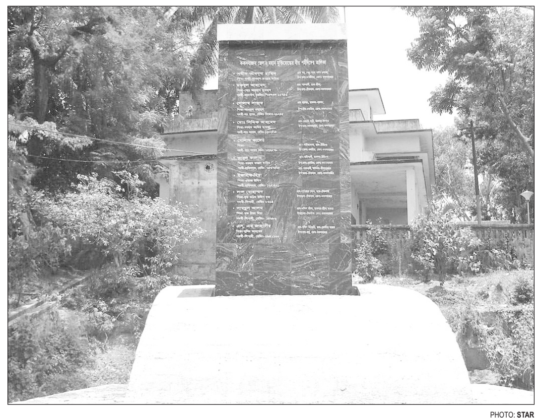
The newly built memorial in Cox's Bazar which allegedly contains names of some fake freedom fighters.