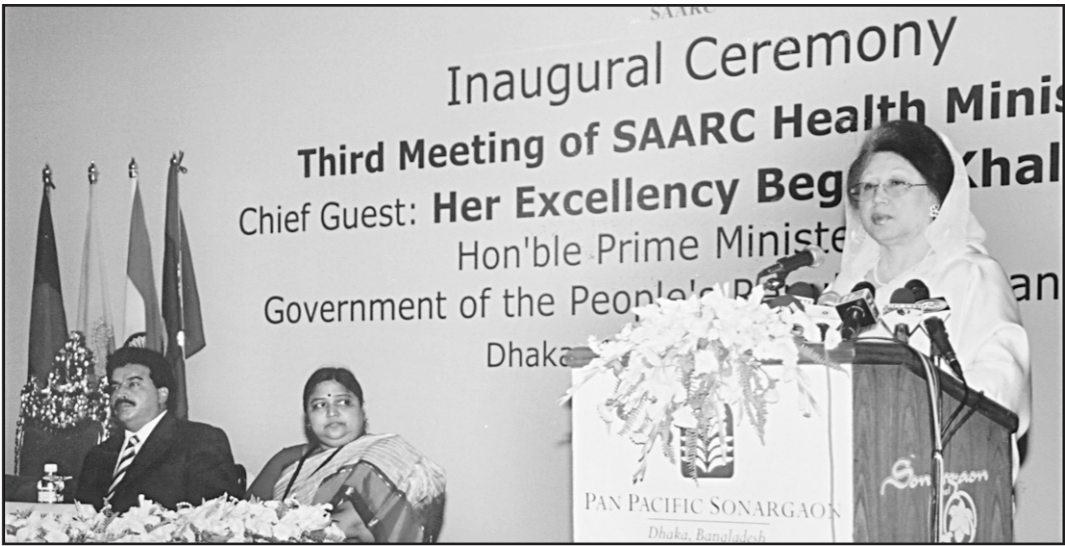
Prime Minister Khaleda Zia speaks at the Third Saarc Health Ministers' Meeting at Sonargaon Hotel in the city yesterday.

He will also make a presentation on Civil-Military Cooperation on 'Operation Sea Angel'.