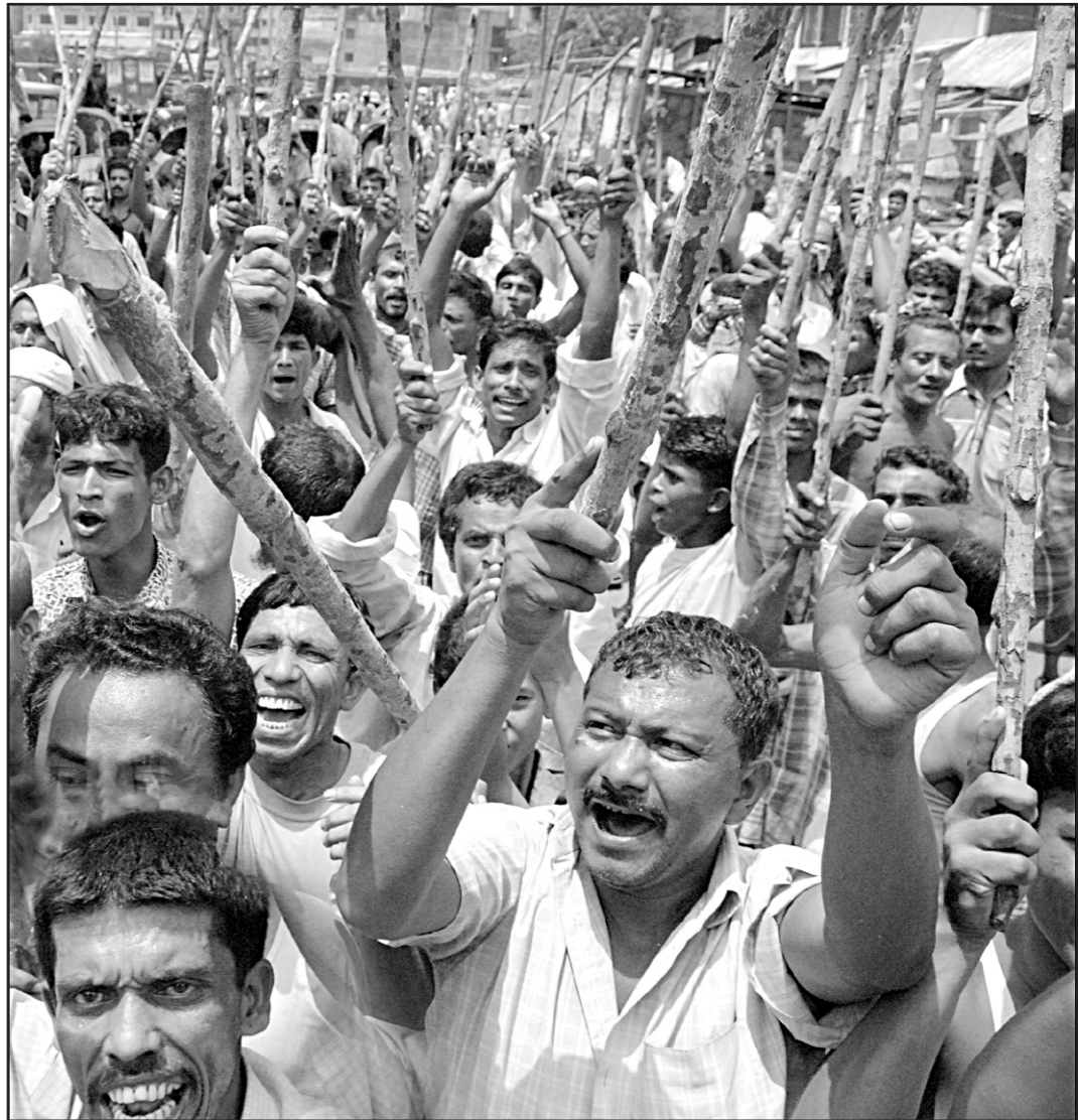
Food godown workers take out a procession carrying sticks at Tejgaon in the city yesterday demanding arrest and punishment to notorious criminal Nabi Solaiman.