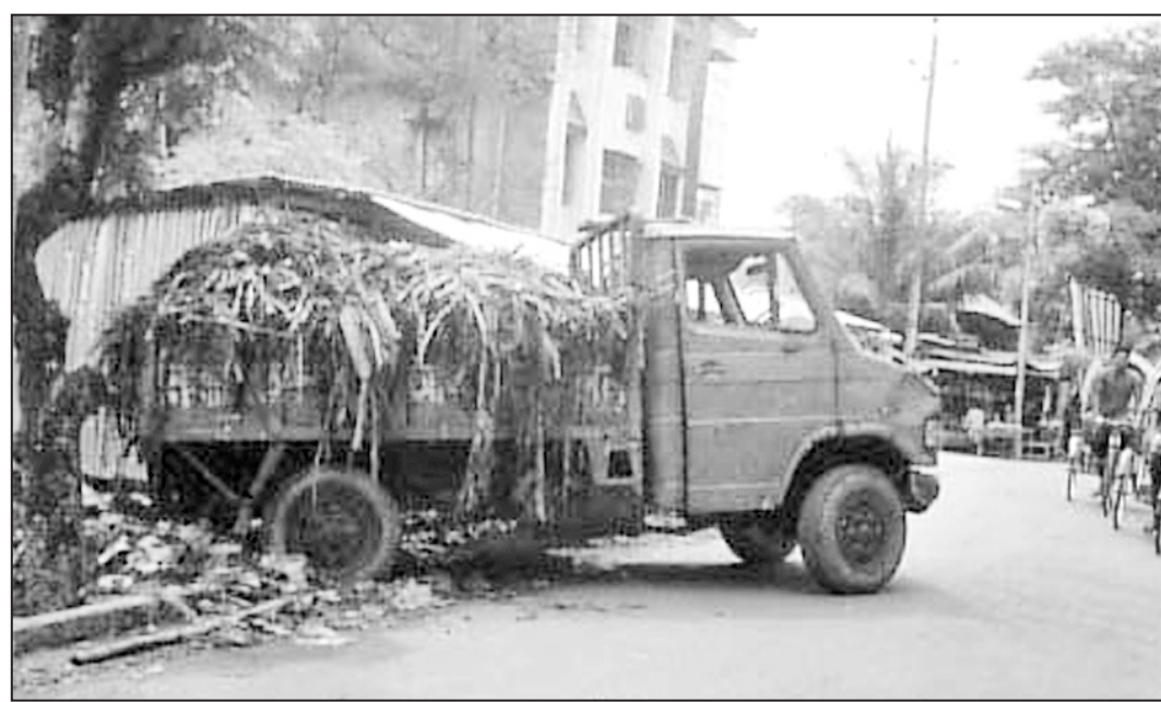
Waste being dumped near a clinic along the Sher-e-Bangla Girls School in Patuakhali town as the pourasabha has no dumping site.

The also demanded adequate compensation for the victims' families from the government.