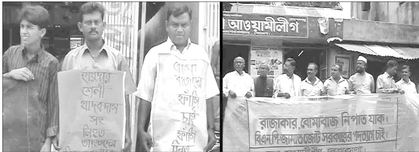
Udichi members (left) and activists of 14-party opposition alliance formed a human chain in Netrakona town yesterday demanding capital punishment to perpetrators of the bomb attack on Udichi office on December 8 last year.

Besides, he disclosed important information about several crime incidents including robbery, which took place in Delduar before August 17 last year.