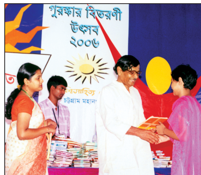
Professor Abdullah Abu Sayeed (2-R) handing over a prize to a youngster at the occasion

The prize-giving ceremony of Bishwa Shahitya Kendra, Chittagong was held recently at Chittagong Municipal Model High School, according to a press release.