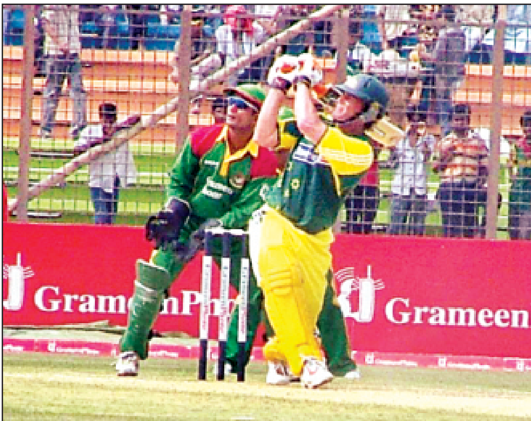
Australia opener Adam Gilchrist launches one of his five sixes during his 46-ball 76 against Bangladesh in the first ODI at the Chittagong Divisional Stadium on Sunday.

Hayden attributed the poor performance of the English team to a hectic schedule and trying conditions in the seven-match series.