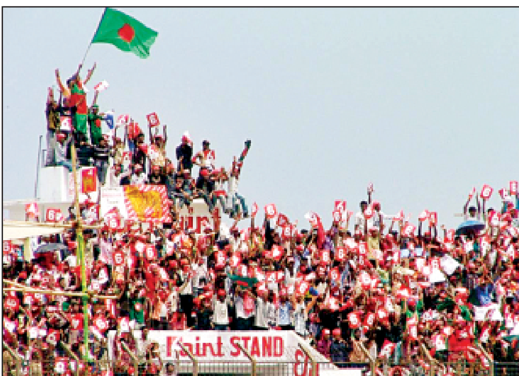
A section of the colourful crowd at the Chittagong Divisional Stadium enjoy their time on Sunday.