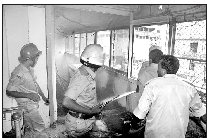
Fire fighters try to put out a fire that broke out in a shop on the third floor of Ramna Bhavan in the city yesterday.