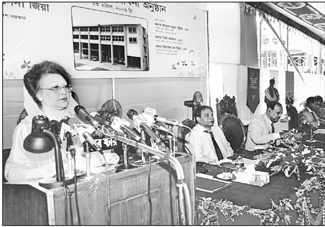
Prime Minister Khaleda Zia speaks at a function on the occasion of the inauguration of Cooperatives Bhavan at Agargaon in the city yesterday.

A doa mahfil will be held after Asr prayers on April 28 at House- 44A, Road-116, Gulshan.